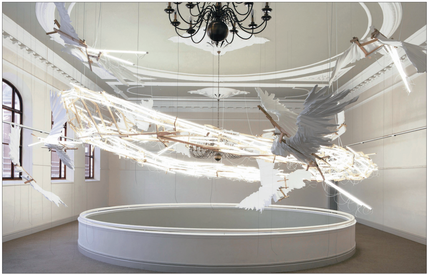
IN ORBIT: Wim Botha's polystyrene, wood and fluorescent tubes installation at the Sasol Art Museum.