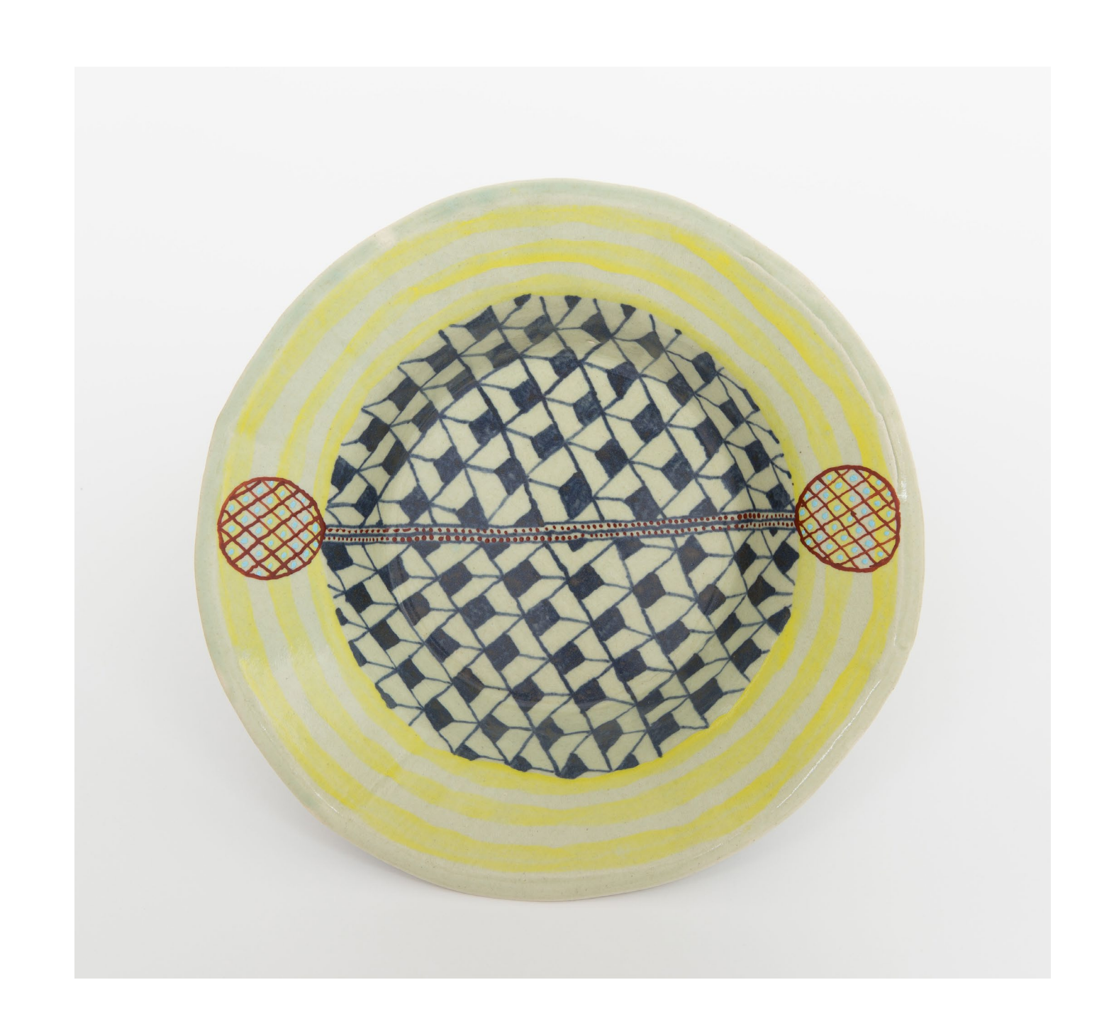
HN1232 The plate with two Tennis bats 5.8.16 Glazed ceramic 25 x 6cm R6 000