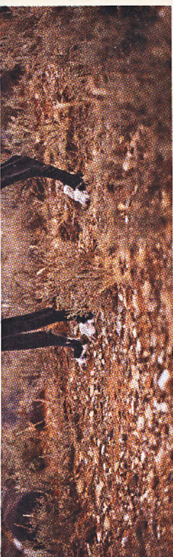
Images from Daniel Naudé's Africanis series. Left: Africanis 3, Strydenburg, April 1 2008. Above: Africanis 1, Strydenburg, March 31 2008