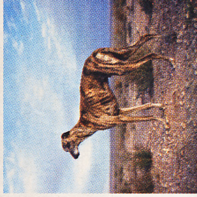
Far left: Africanis 10, Strydenburg, April 1 2008 Middle: Africanis 7, Barkly East, June 30 2007 Left: Africanis 2, Strydenburg, April 1 2008

tory: "The dog I saw) had no master. There was no planning, no breeding, no hand on it." It was impossible to define or control, "yet it knew its path".