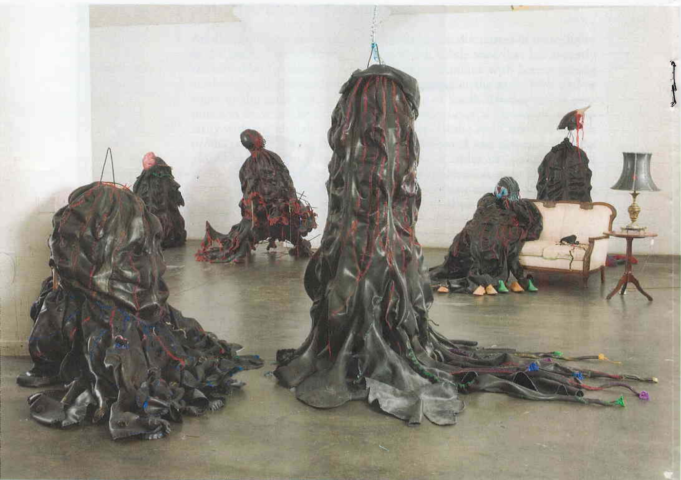
Nicholas Hlobo, Umtshotsho , 2009, installation with Izithunzi and Kubomvu , works in progress photographed in the artist's studio, © Nicholas Hlobo, courtesy STEVENSON, Cape Town and Johannesburg, photo: John Hodgkiss

In particular, this nuance emerges through materials, the continued language of rubber and ribbon. Instead of retaining the shape of either an inner-tube or the smooth width of a ribbon, as in Dream Catcher , Hlobo's Standard Bank Young Artist exhibition 'Umtshotsho' reflects the artist's growing intimacy with and metaphorical handling of materials. The more ornate forms in the exhibition exemplify Hlobo's playful material craftsmanship and cultural references.