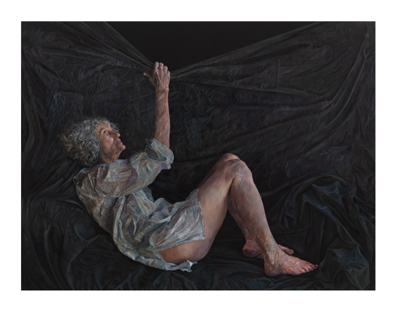
A Thin Veil, 2024 Oil on canvas 190 x 250cm