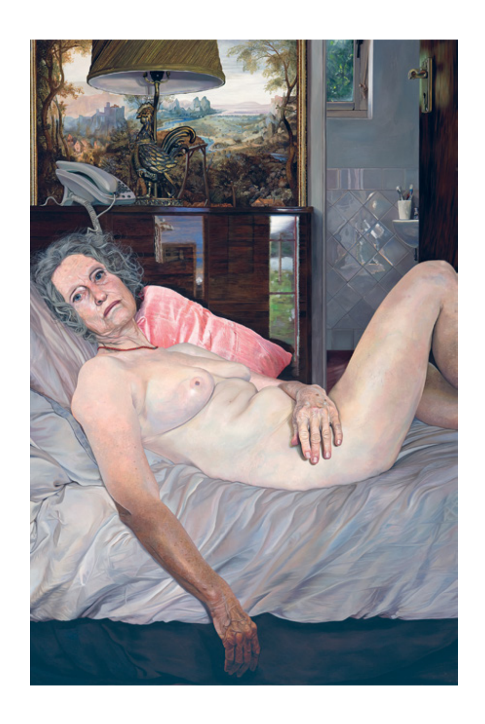
Beloved, 2008 Oil on canvas 300 x 200cm