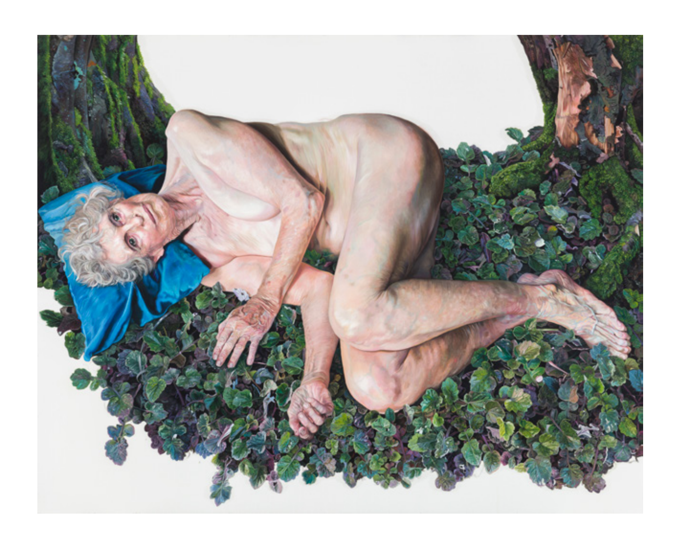
Proverb 3, 2021 Oil on canvas 150 x 190cm