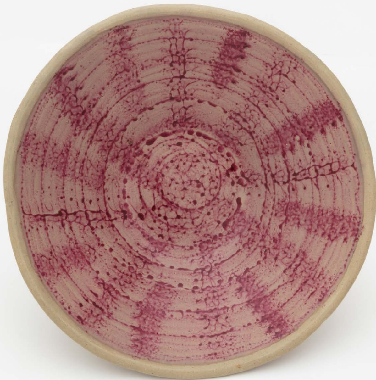
Bowl with pinkish glaze, 28 August 2013 Glazed ceramic 8 x 24cm