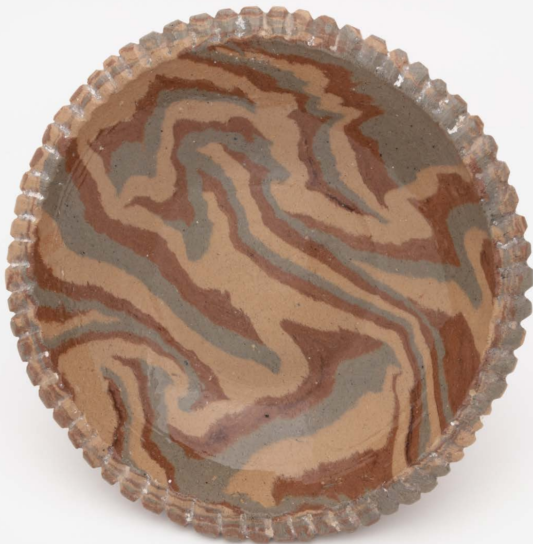
Marbled bowl Glazed ceramic 5.5 x 23cm