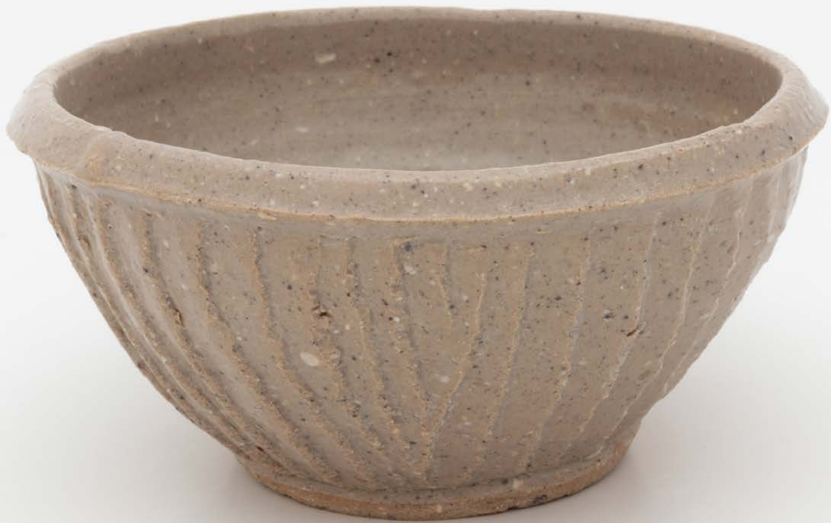
Small bowl II Glazed ceramic 7 x 14cm Inscribed HN