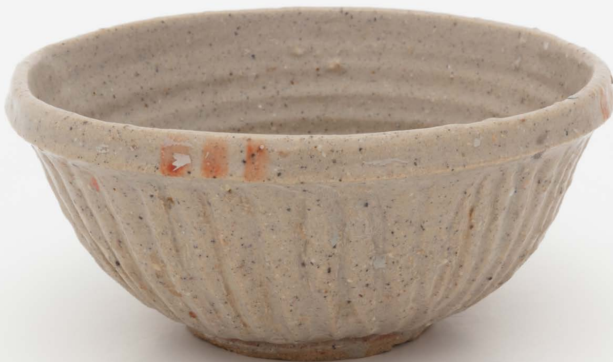
Small bowl I Glazed ceramic 7 x 14cm Inscribed HN