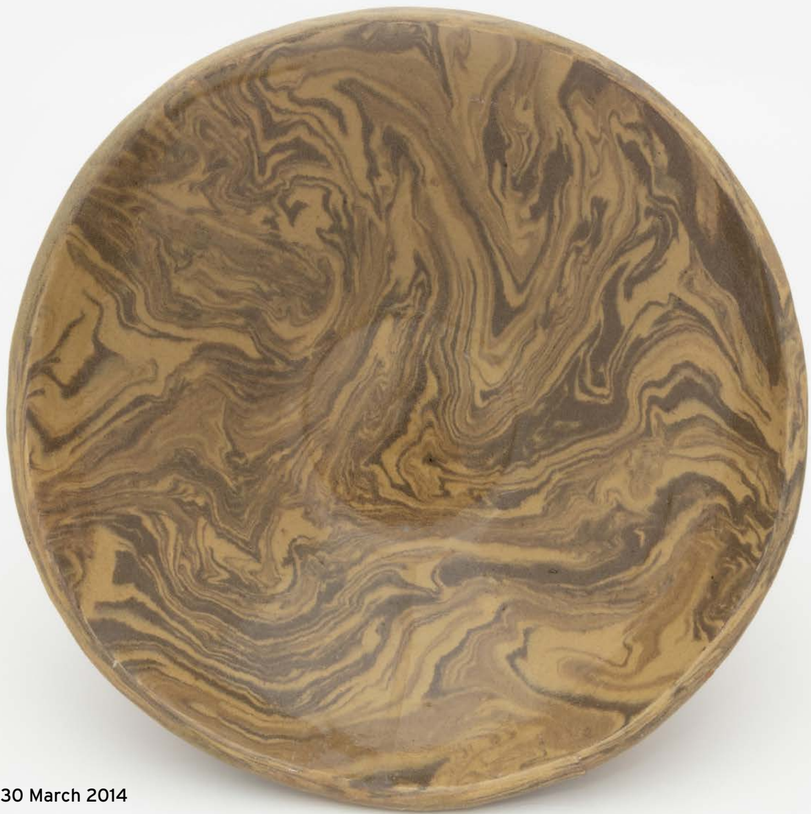
Marbled bowl, 30 March 2014 Glazed ceramic 9 x 25cm Inscribed NH