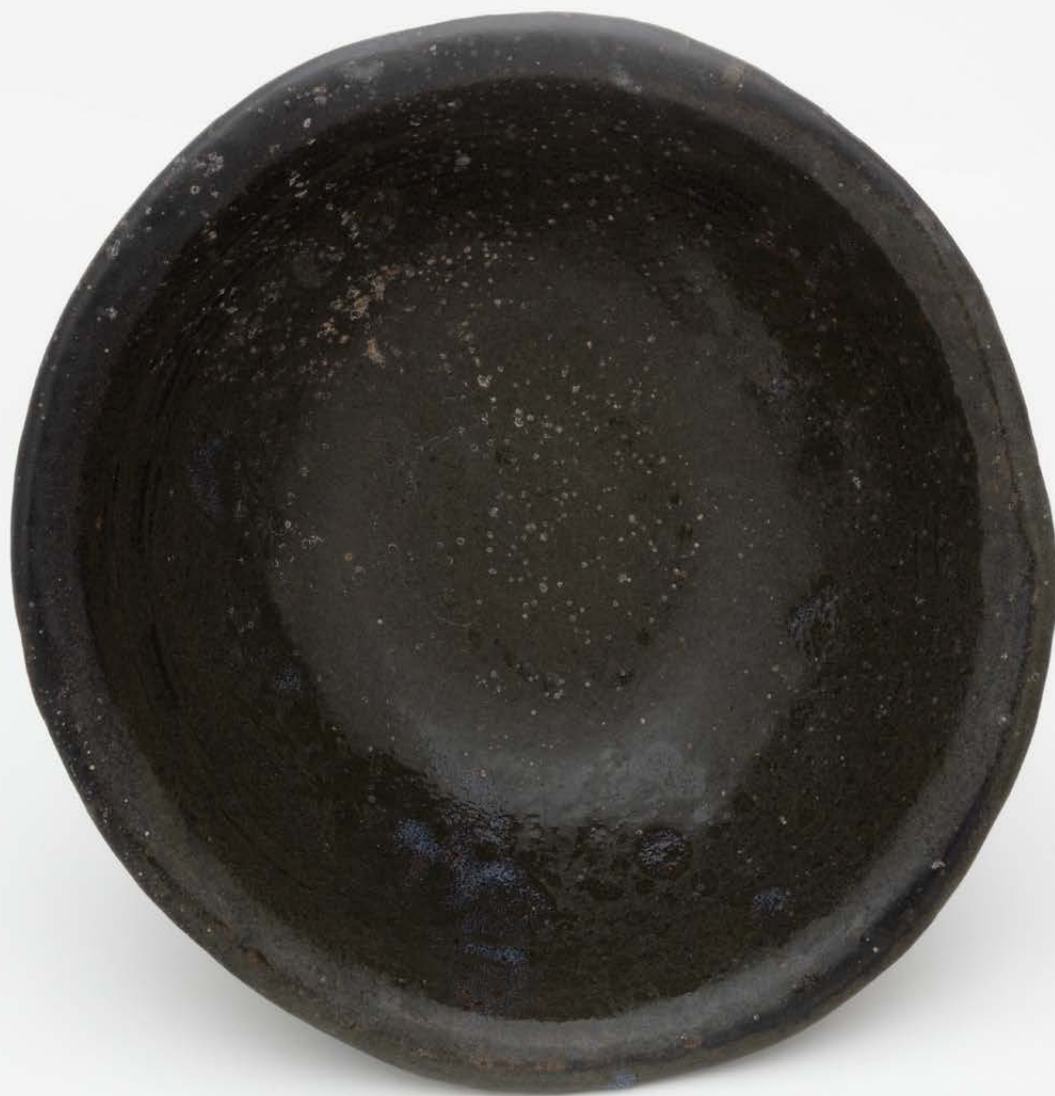
Dark bowl, 7 June 2013 Glazed ceramic 8.5 x 22.5cm