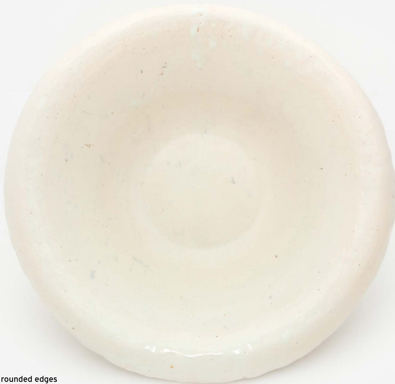
Bowl with rounded edges Glazed ceramic 10 x 33cm