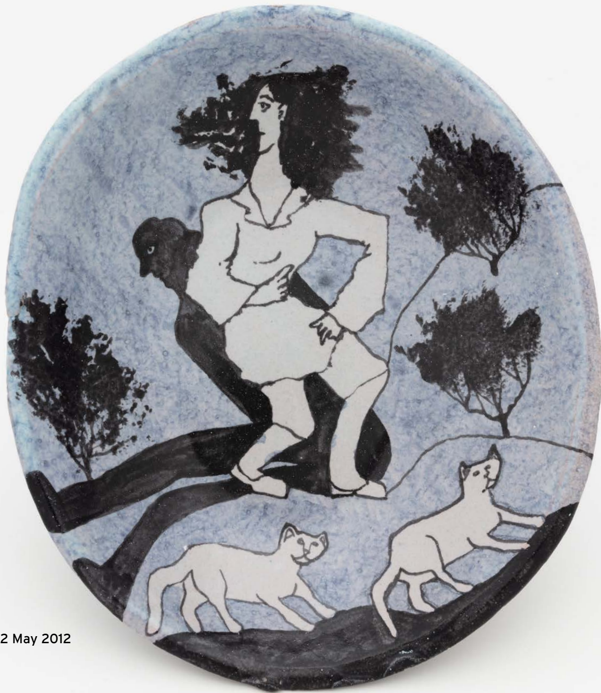
Scene with cats bowl, 2 May 2012 Glazed ceramic 27 x 23.5cm Inscribed NHH