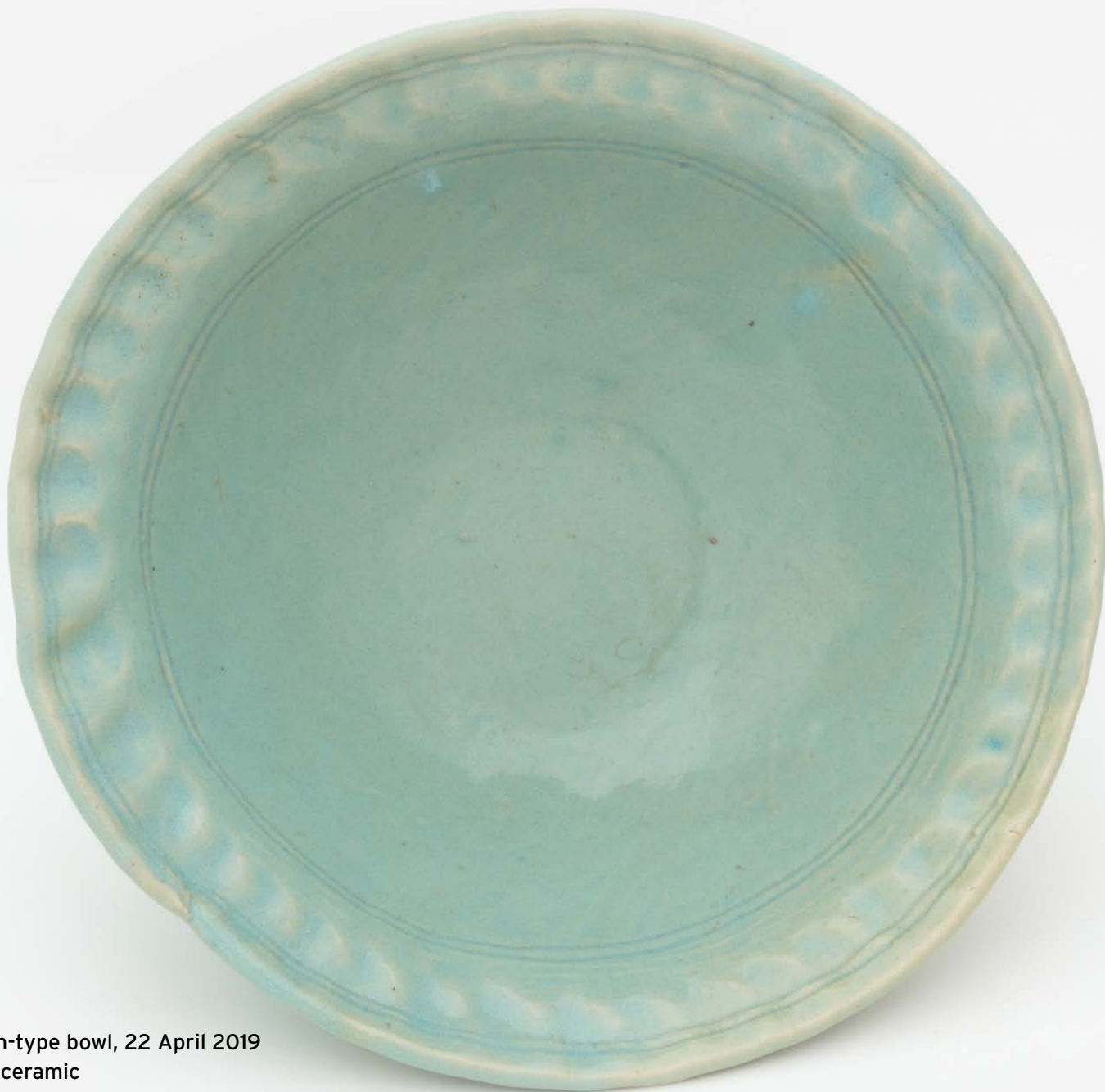
Celadon-type bowl, 22 April 2019 Glazed ceramic 12 x 26.5cm Inscribed NHH