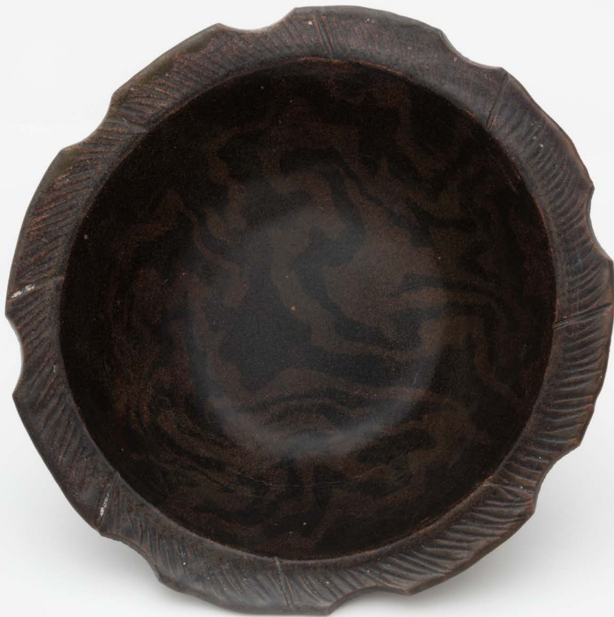
Dark marbled bowl with spiralled edge, 15 July 2013 Glazed ceramic 7.5 x 26cm