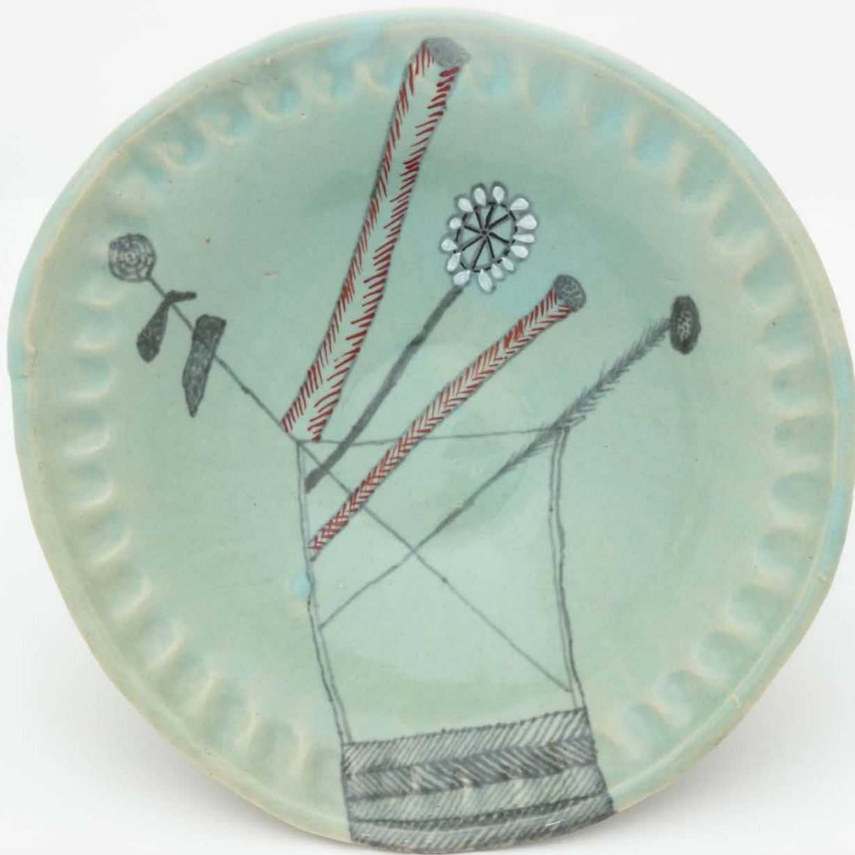
Celadon-type bowl with vase and flowers, 22 April 2019