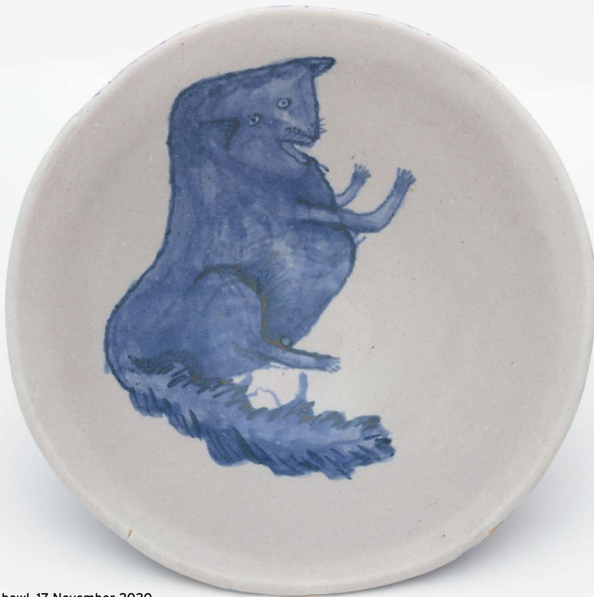
Blue creature bowl, 17 November 2020 Glazed ceramic 10 x 26cm Inscribed NHH