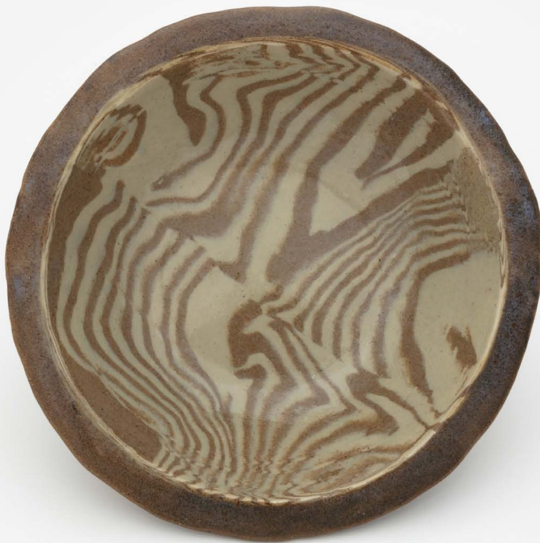
Marbled bowl, 8 July 2013 Glazed ceramic 6 x 22.5cm