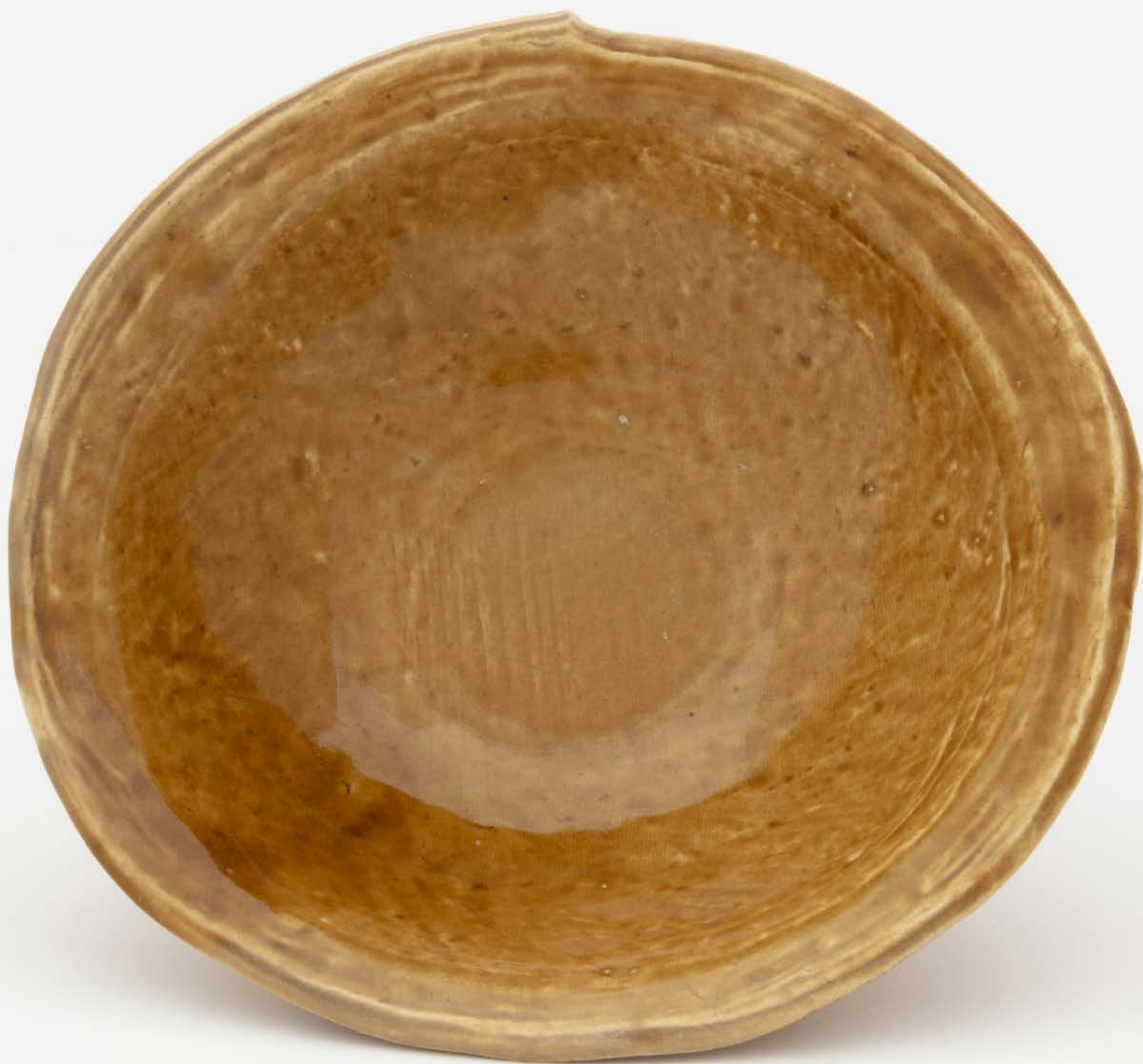
Beige bowl I Glazed ceramic 7 x 20.5cm