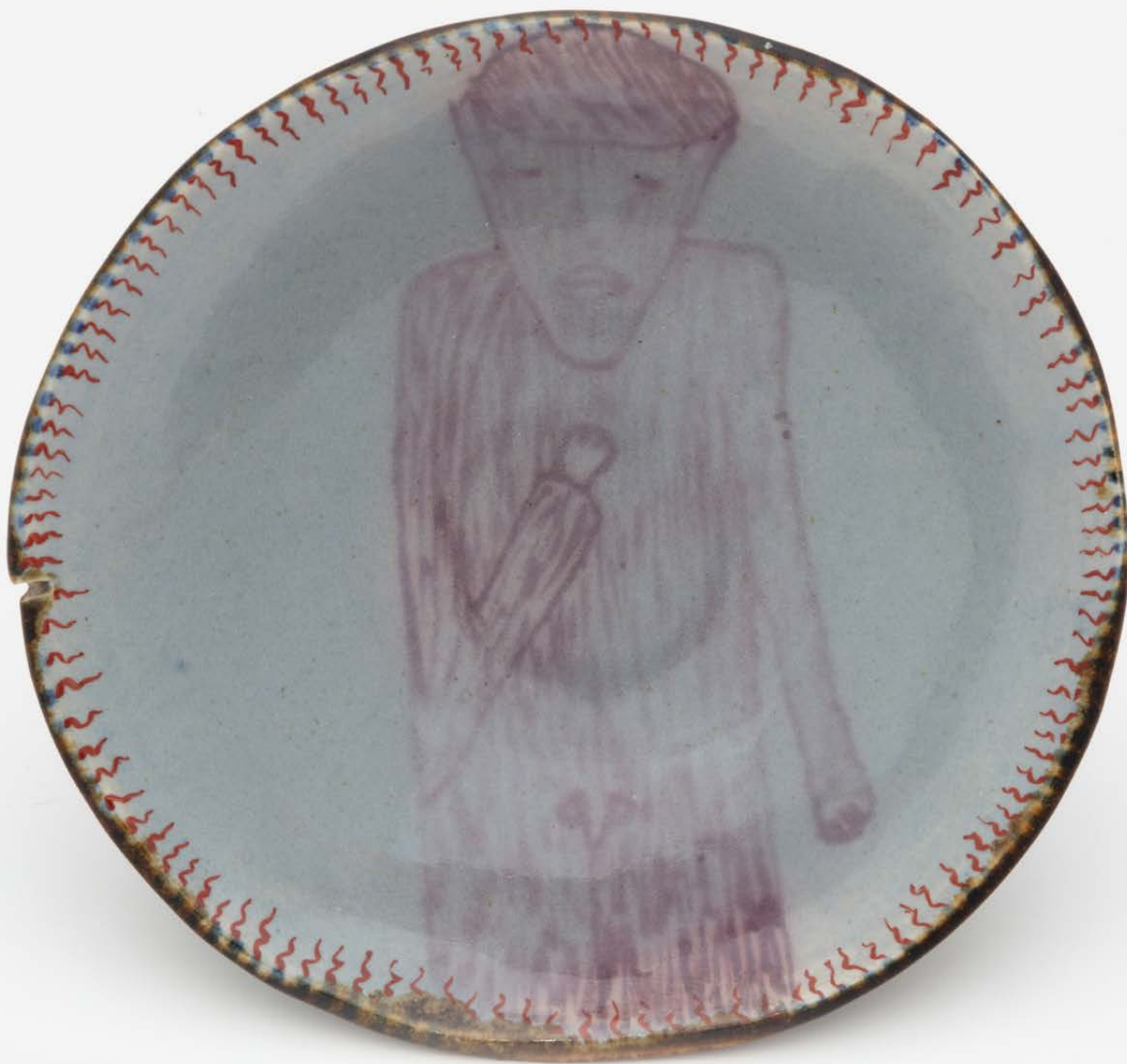
'Things seen in the fire', 4 December 2018 Detail from a set of 7 bowls