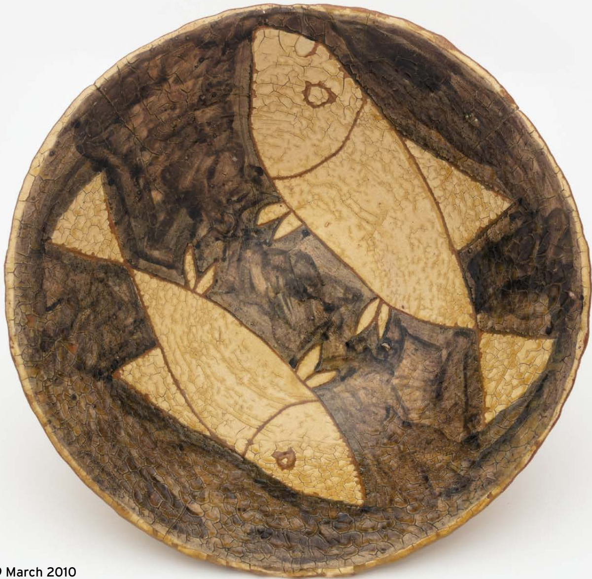
Fish bowl, 9 March 2010 Glazed ceramic 8.5 x 26.5cm Inscribed NHH