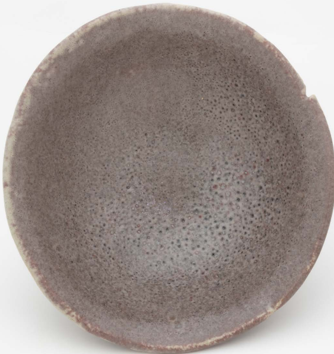
Bowl with glaze test I Glazed ceramic 7.5 x 19cm