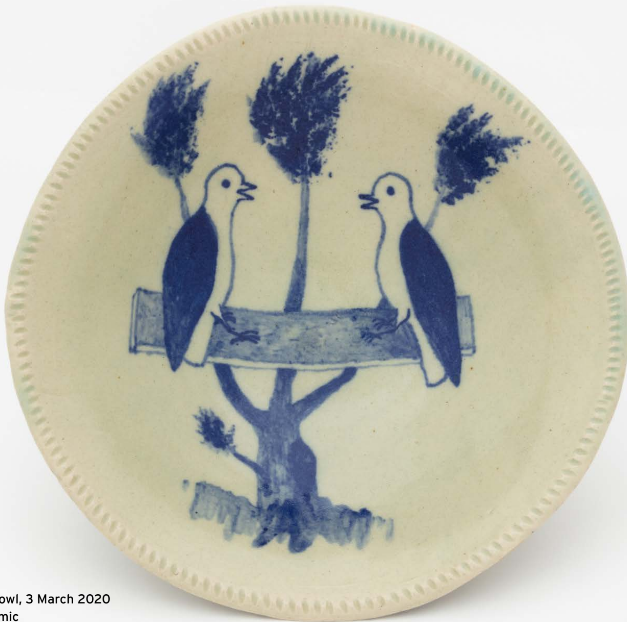
Blue birds bowl, 3 March 2020 Glazed ceramic 8.5 x 26cm Inscribed NHH