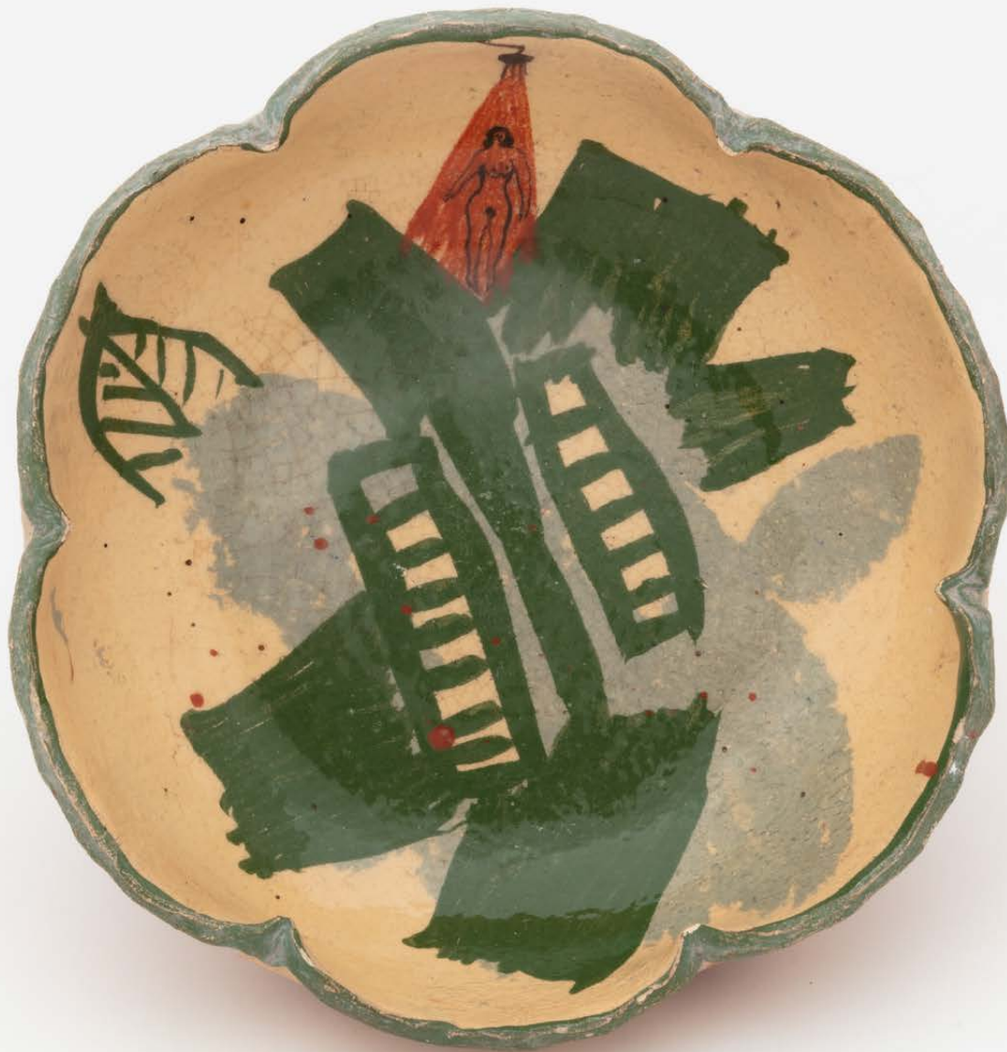
Lady in the shower bowl, c.1977 Glazed ceramic 5 x 18cm