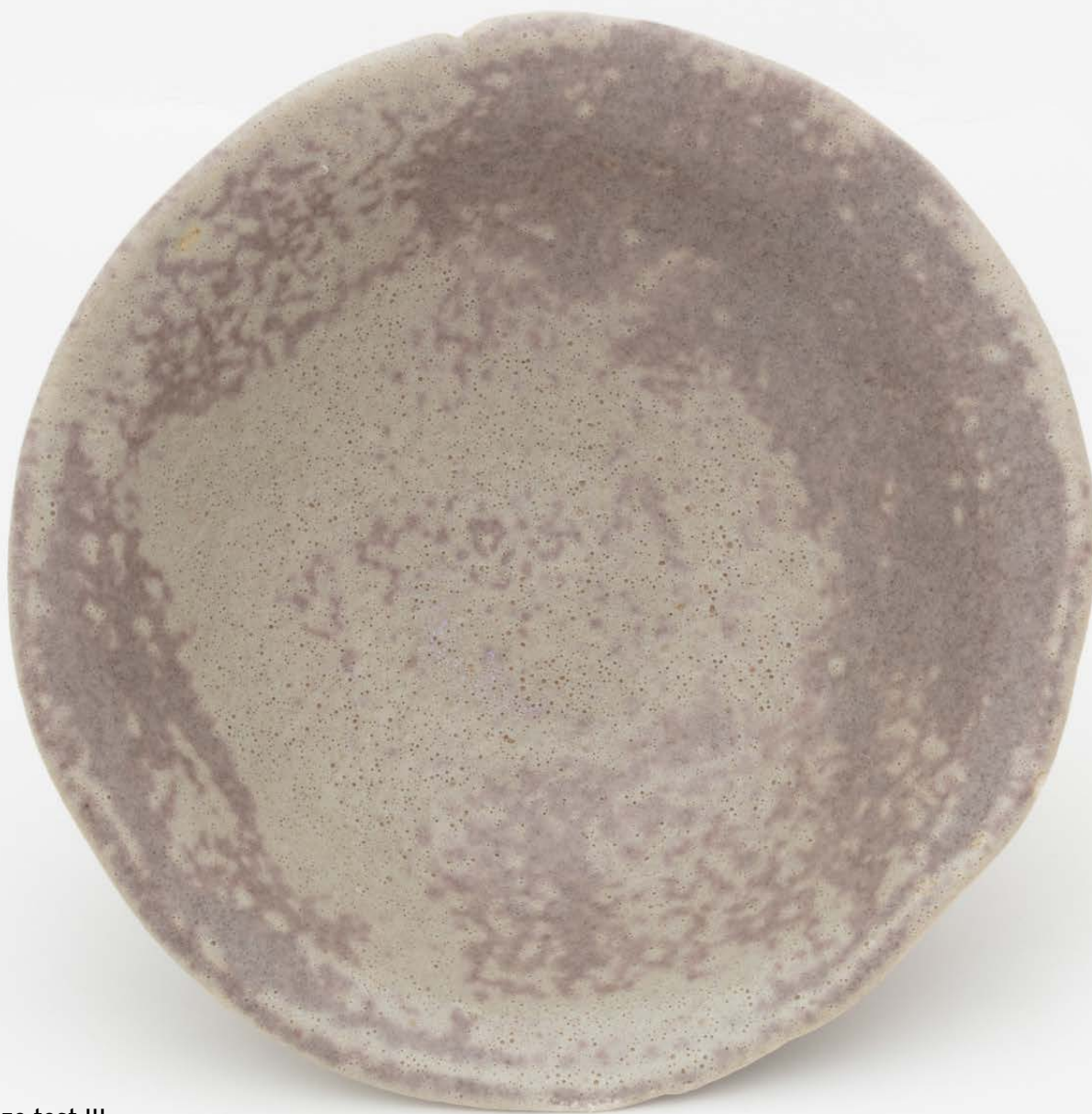
Bowl with glaze test III Glazed ceramic 7.5 x 21.5cm