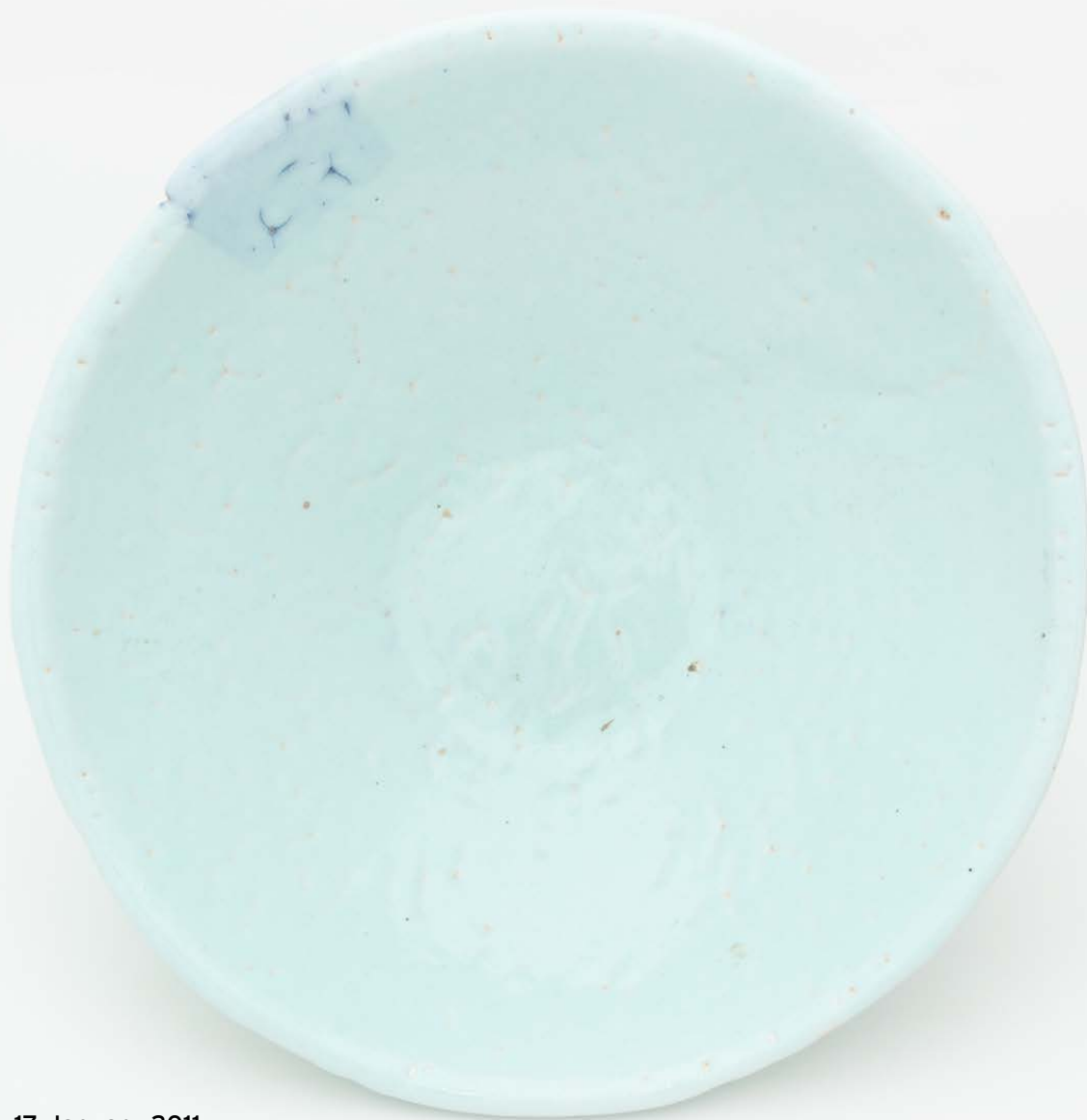
Turquoise bowl, 17 January 2011 Glazed ceramic 11 x 28cm Inscribed NHH