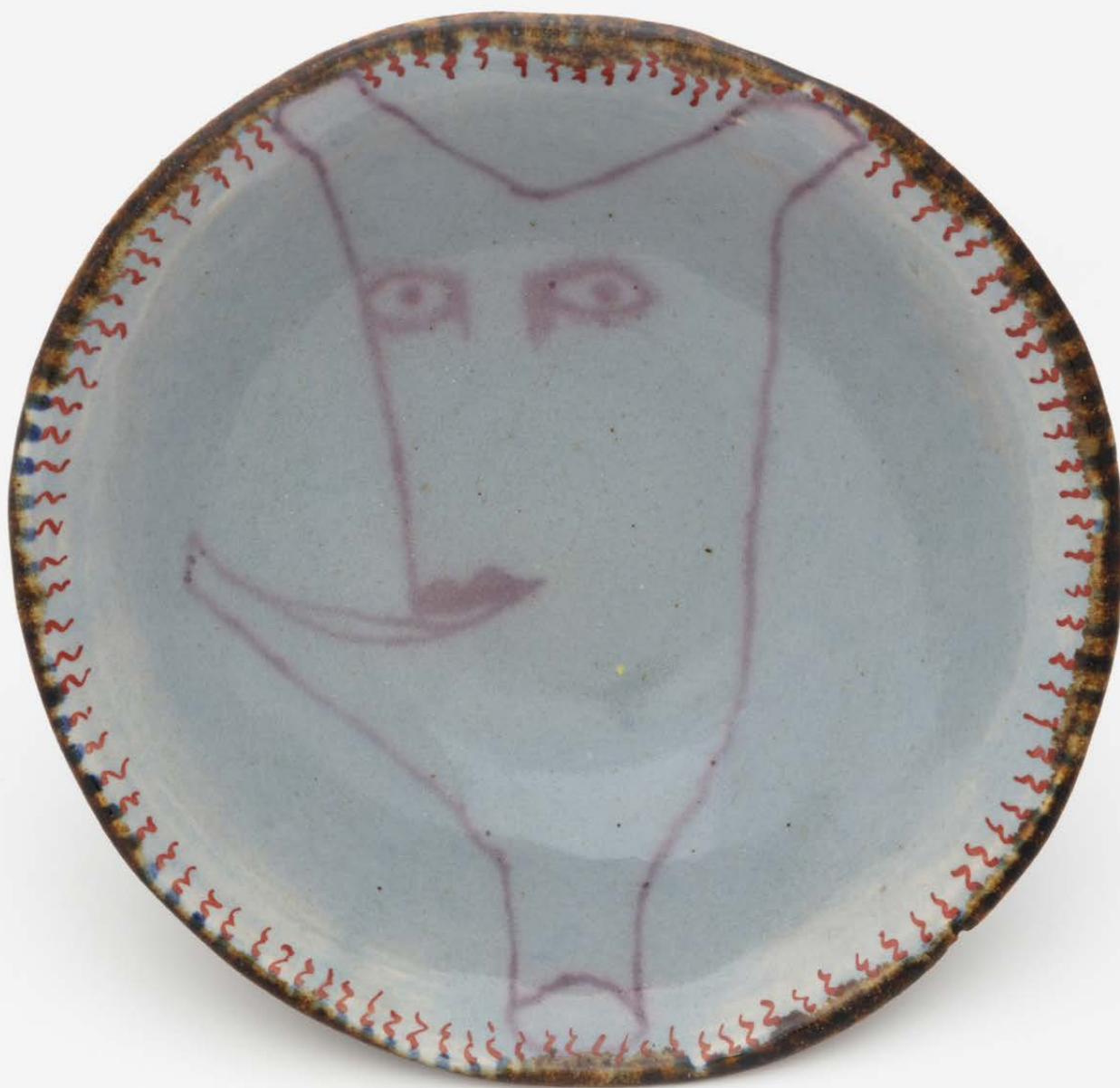
'Things seen in the fire', 4 December 2018 Detail from a set of 7 bowls