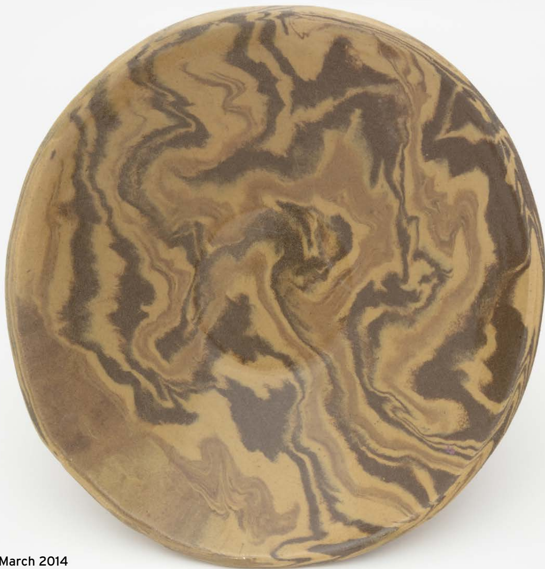
Marbled bowl, 30 March 2014 Glazed ceramic 8 x 24cm Inscribed NH