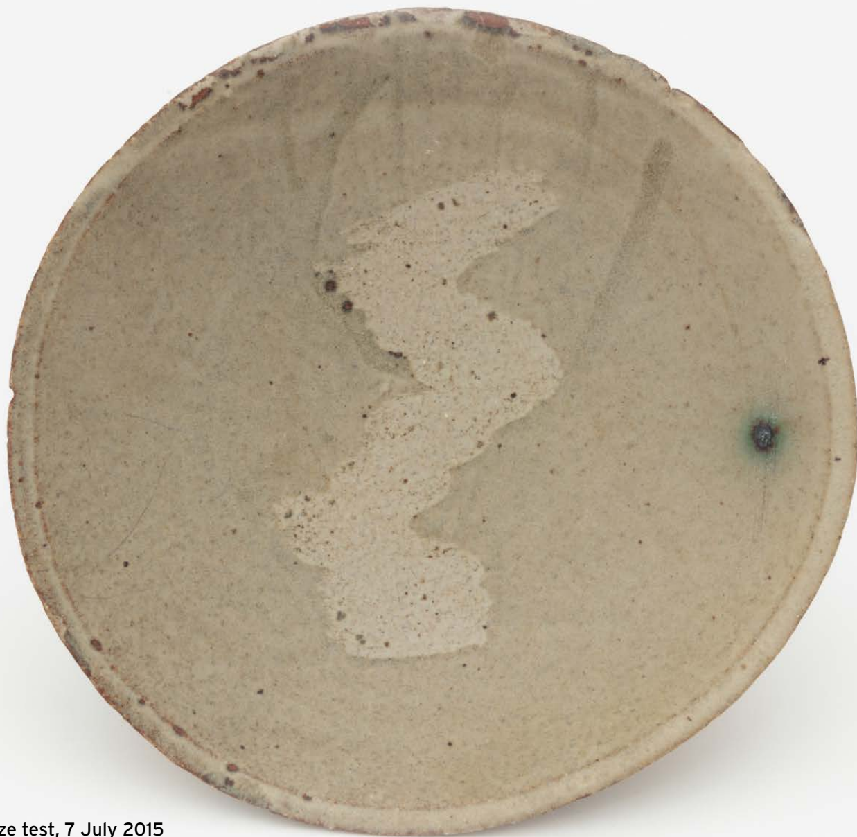
Bowl with glaze test, 7 July 2015 Glazed ceramic 6 x 21cm Inscribed NHH