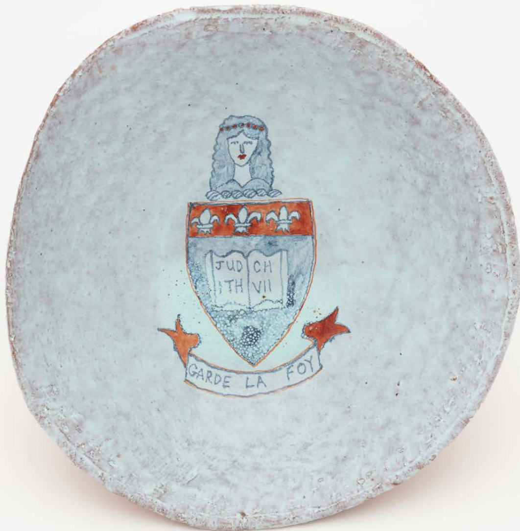
Garde La Foy Glazed ceramic 6 x 20cm Inscribed NH