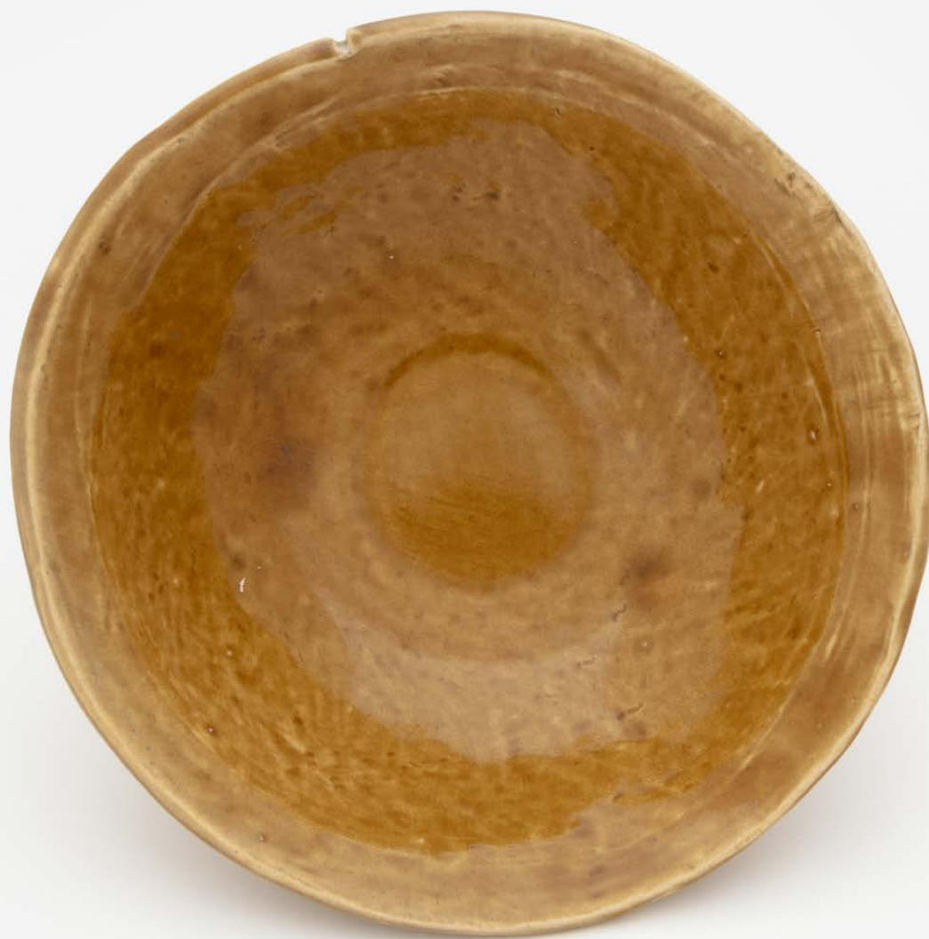
Beige bowl II Glazed ceramic 7 x 20.5cm