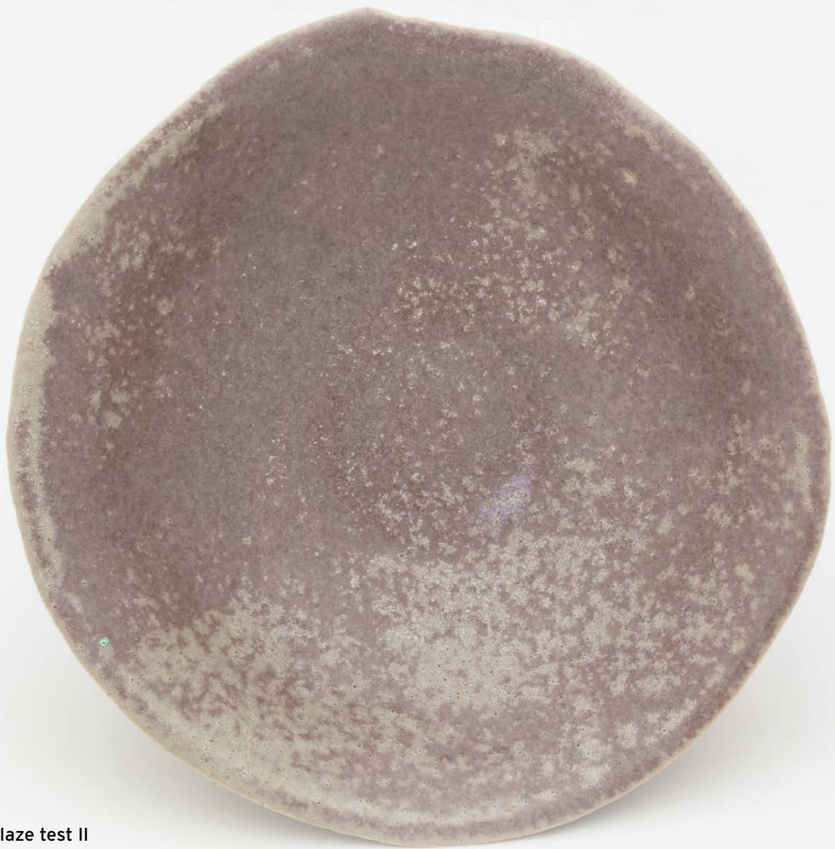
Bowl with glaze test II Glazed ceramic 7.5 x 21.5cm