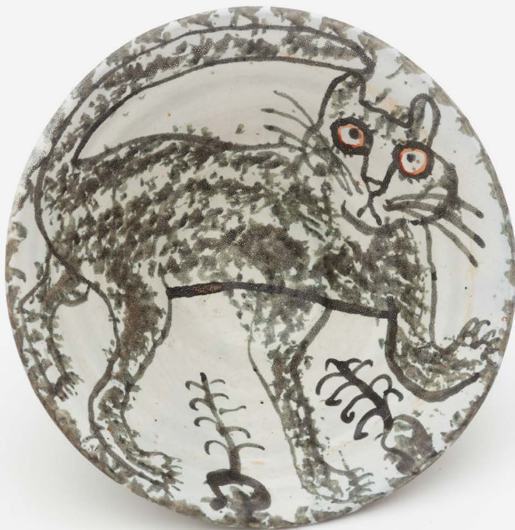
Cat bowl Glazed ceramic 7 x 17cm