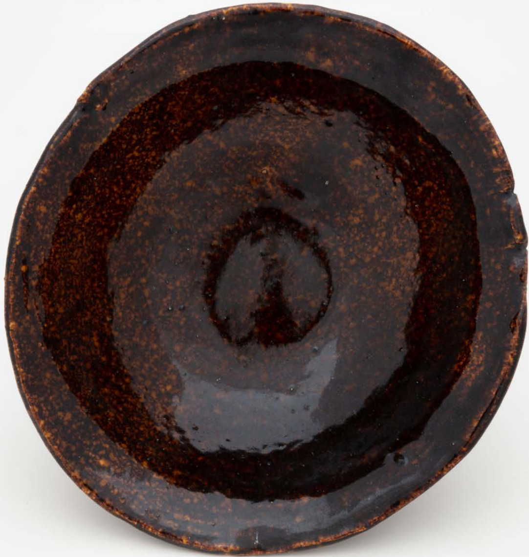
Chocolate brown glaze bowl Glazed ceramic 6.5 x 22.5cm