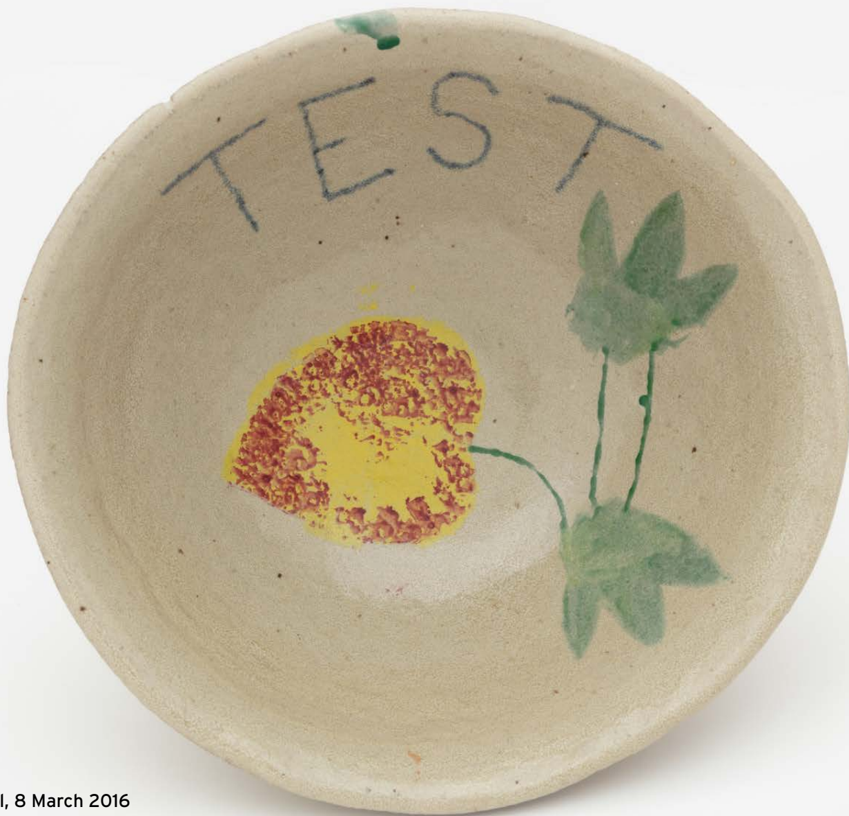
Test bowl, 8 March 2016 Glazed ceramic 9 x 23cm Inscribed NHH