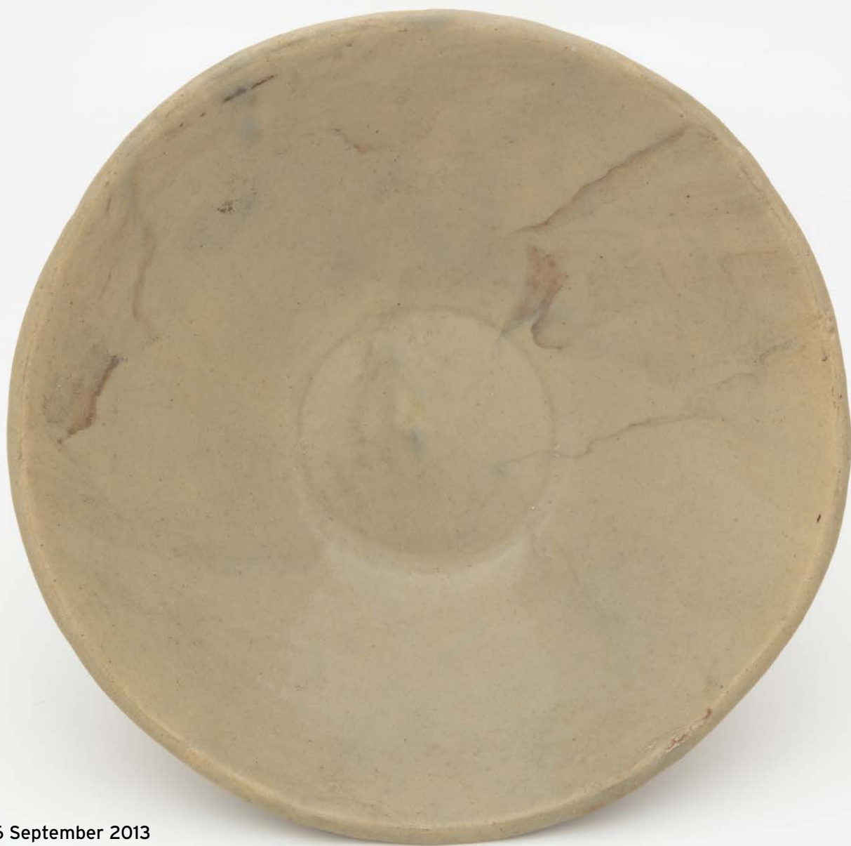
Stone bowl, 6 September 2013 Glazed ceramic 7.5 x 23.5cm