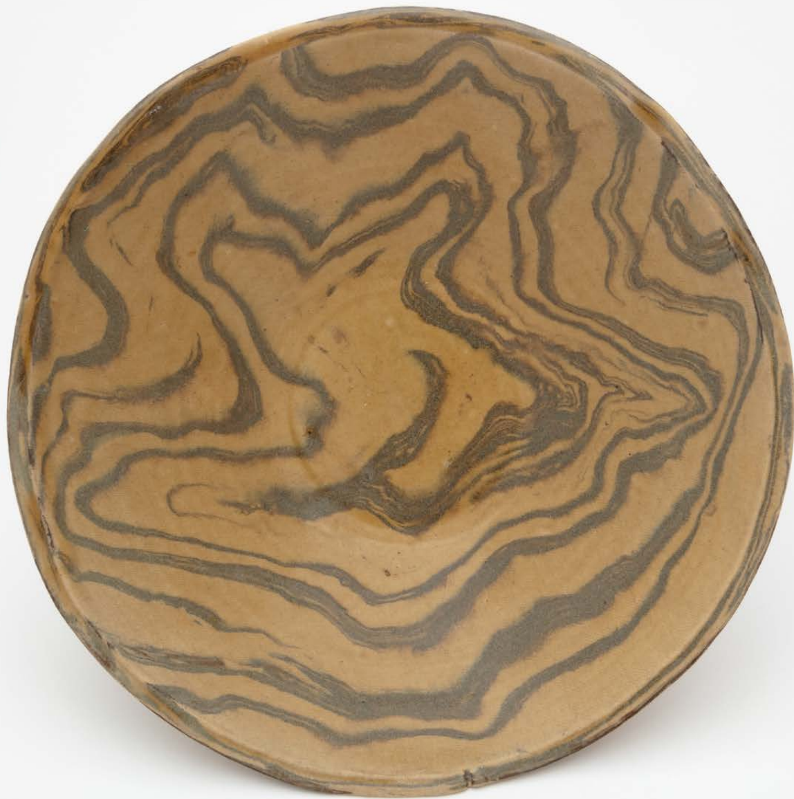
Marbled bowl with floral motif, 17 October 2013 Glazed ceramic 8 x 24cm