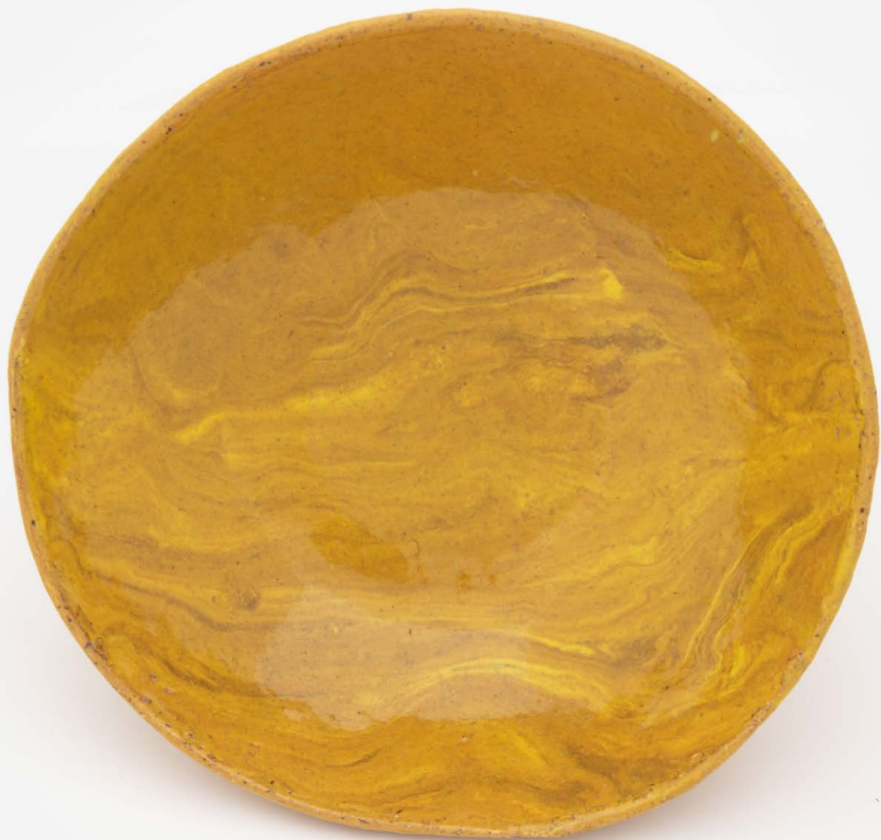
Bright marbled bowl Glazed ceramic 6.5 x 20.5cm