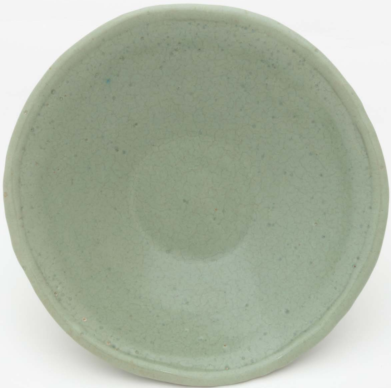
Celadon-type bowl with red foot, 28 November 2014 Glazed ceramic 9 x 24.5cm Inscribed NHH