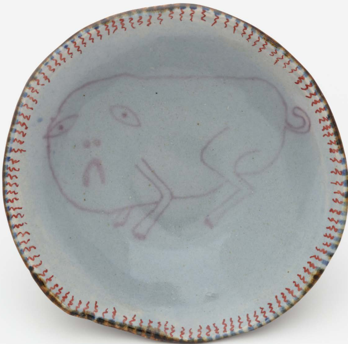
'Things seen in the fire', 4 December 2018 Detail from a set of 7 bowls