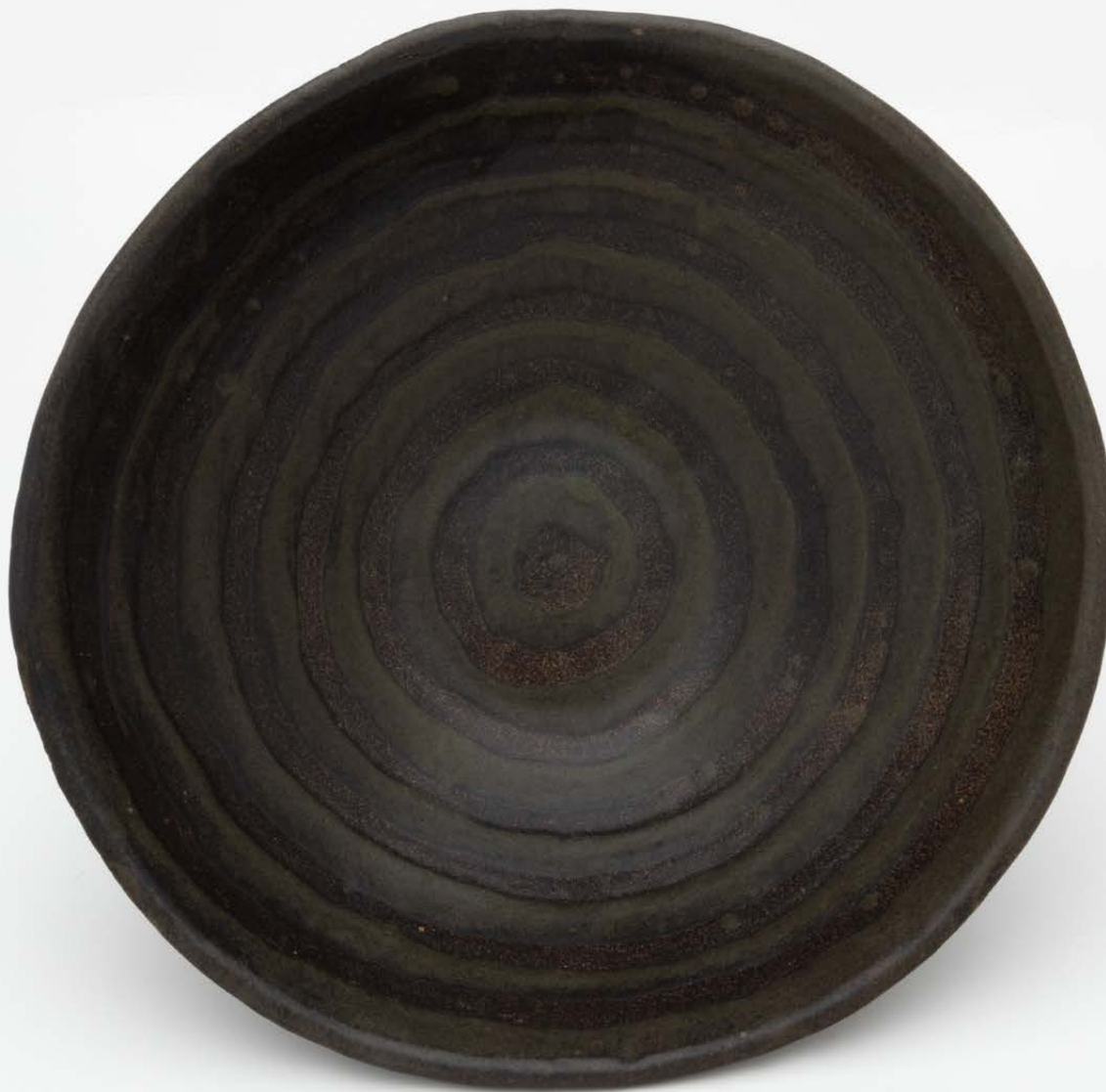
Dark bowl with circular lines, 28 August 2013 Glazed ceramic 10 x 25.5cm