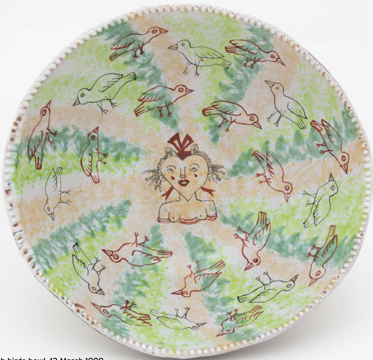
Lady with birds bowl, 12 March 1999