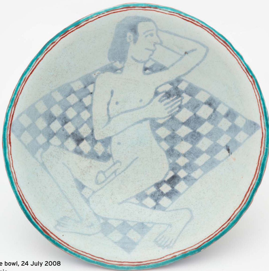
Persian paste bowl, 24 July 2008 Glazed ceramic 8.5 x 20.5cm Inscribed NHH