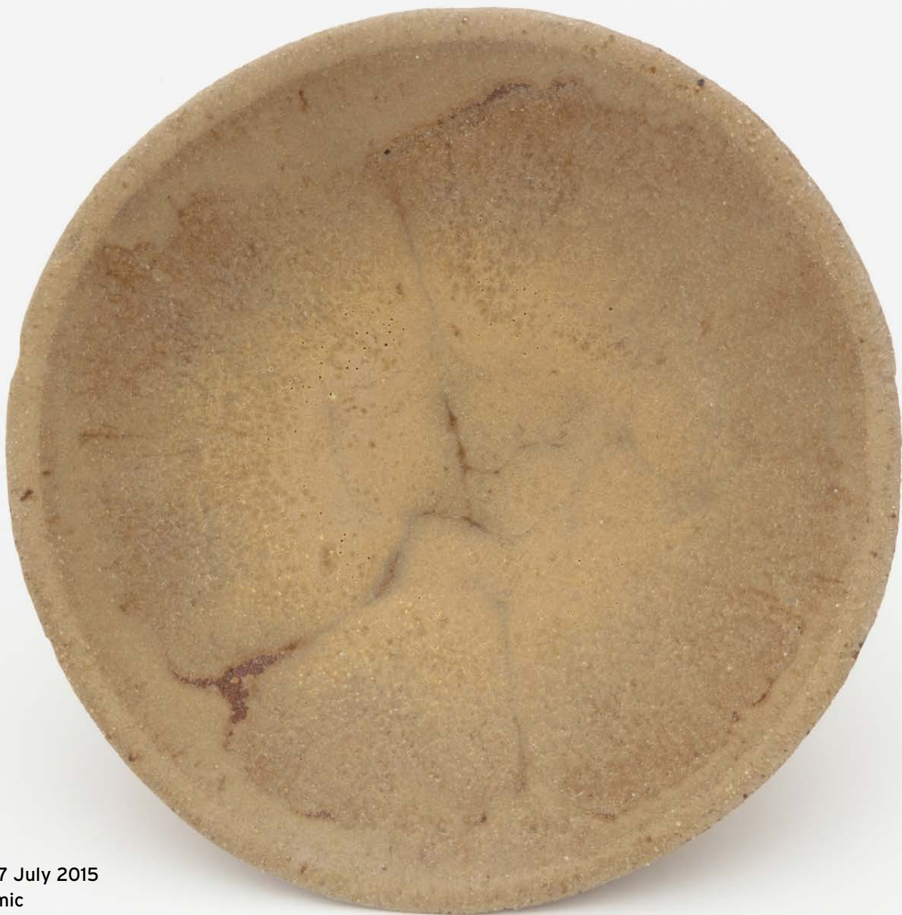
Stone bowl, 7 July 2015 Glazed ceramic 6 x 20cm Inscribed NHH