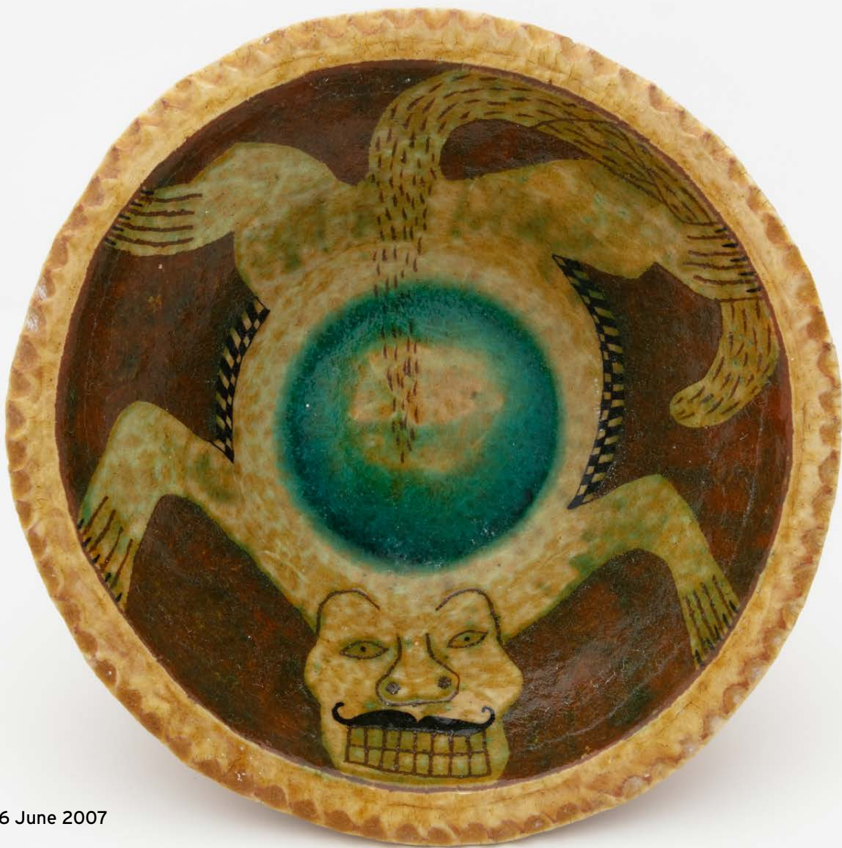
Creature bowl, 6 June 2007 Glazed ceramic 10 x 32cm Inscribed NHH