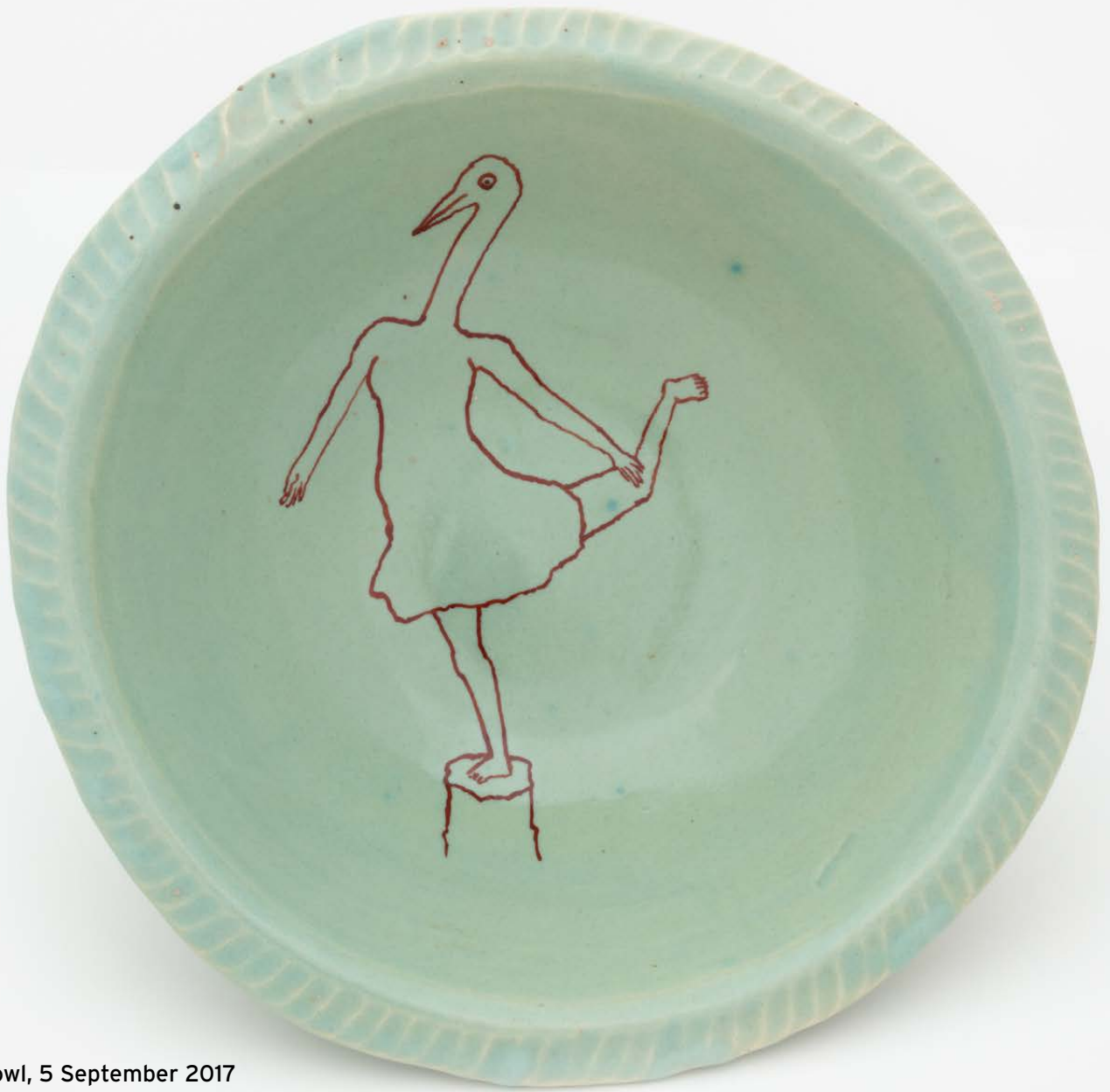
Dancer bowl, 5 September 2017 Glazed ceramic 7.5 x 28.5cm Inscribed NHH