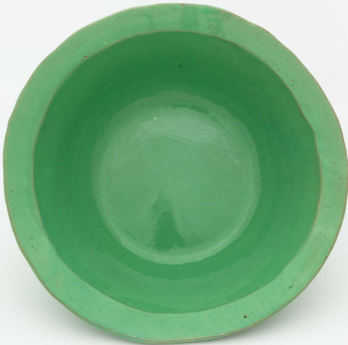
Green bowl, 31 October 1997 Glazed ceramic 9 x 29cm Inscribed NH