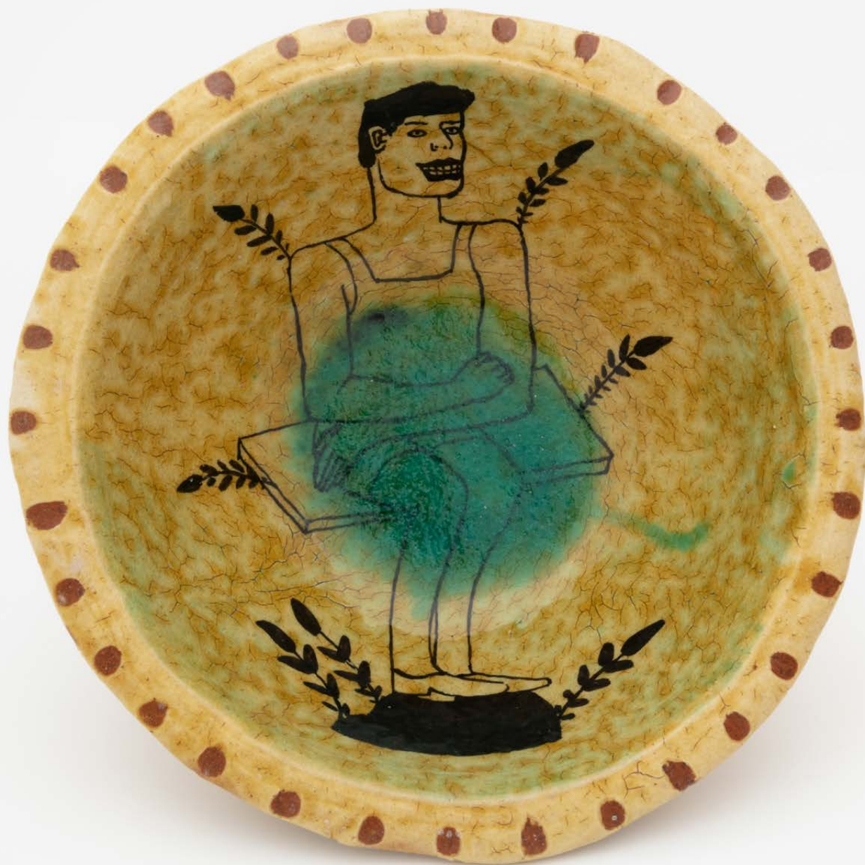
Sitting on a bench bowl, 8 May 2007 Glazed ceramic 8 x 24cm