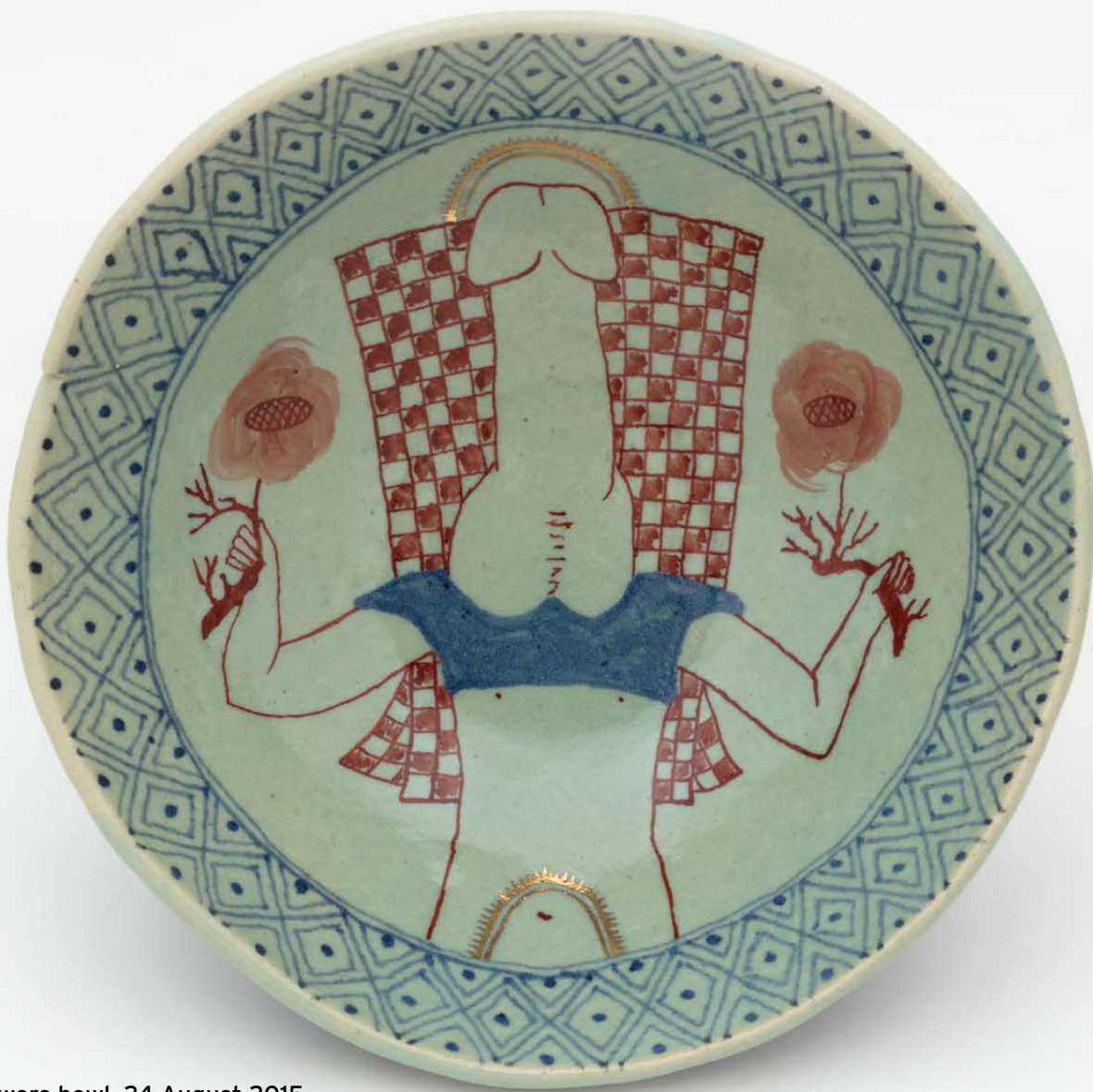
Cock and flowers bowl, 24 August 2015