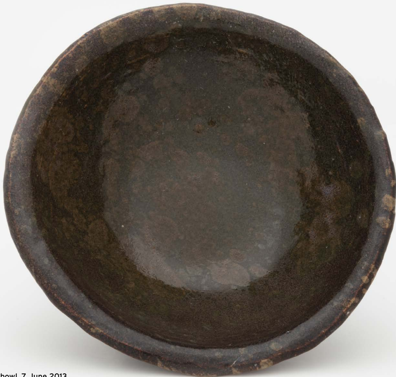
Brown bowl, 7 June 2013 Glazed ceramic 8.5 x 22.5cm