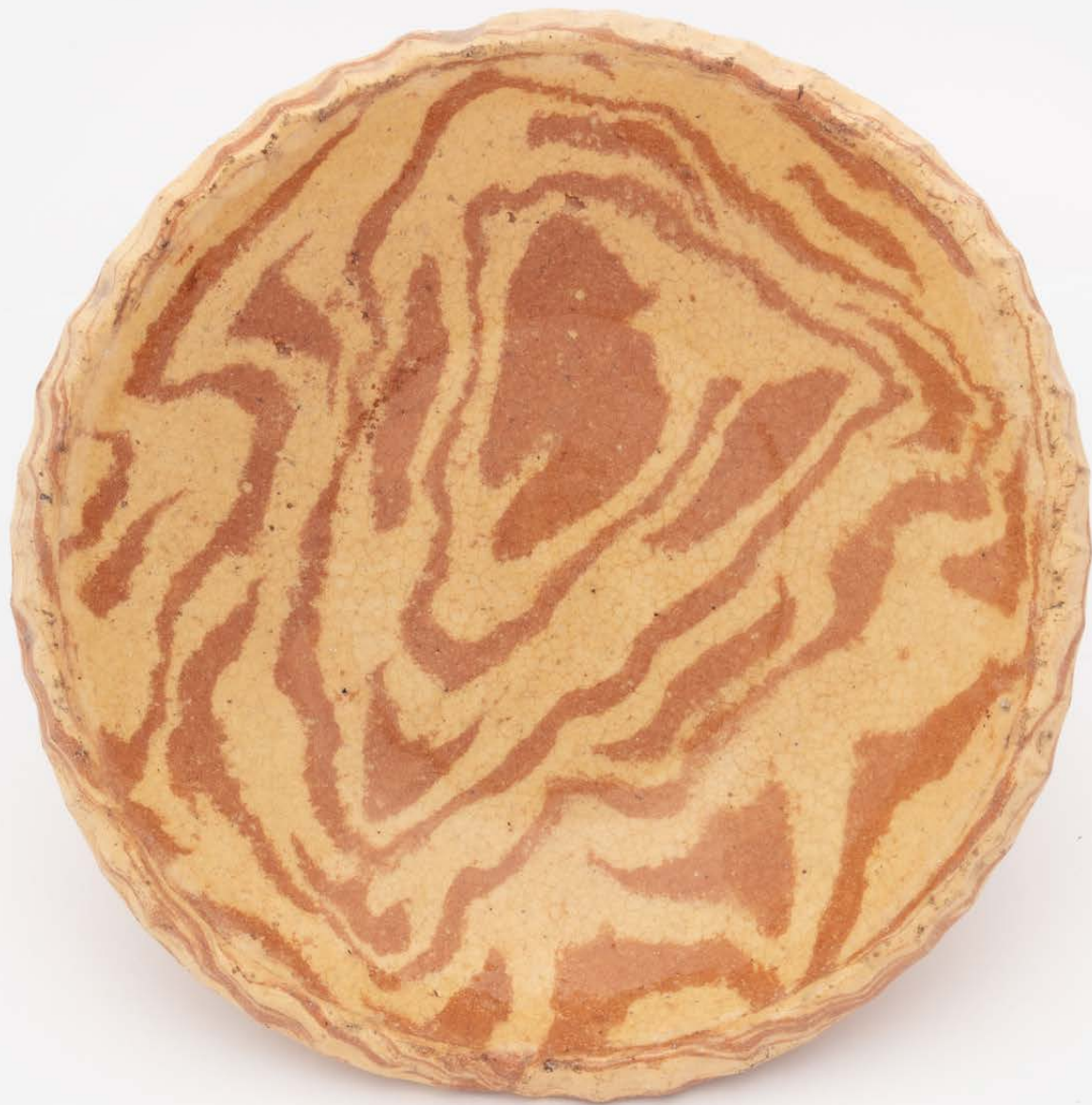
Marbled bowl Glazed ceramic 5.5 x 24cm