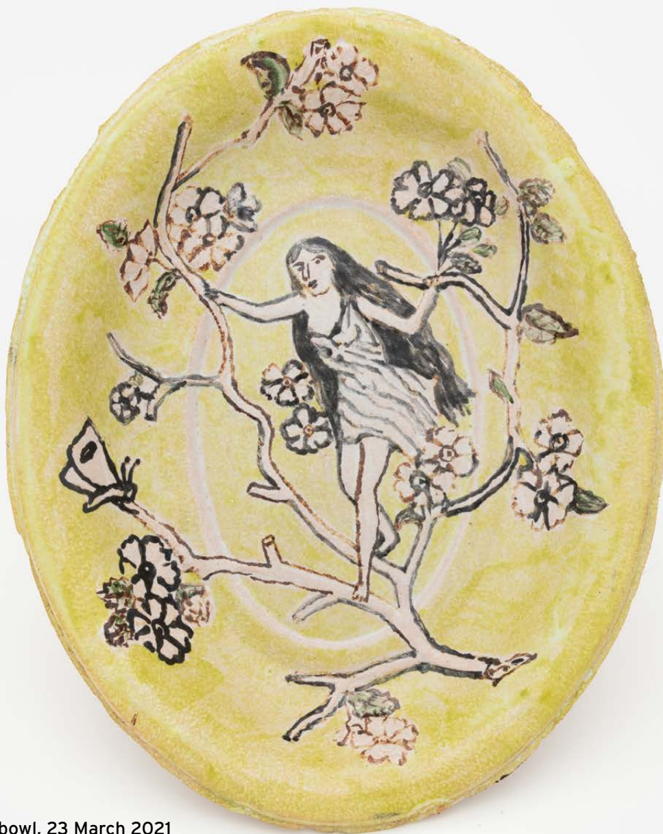
Lady among flowers bowl, 23 March 2021