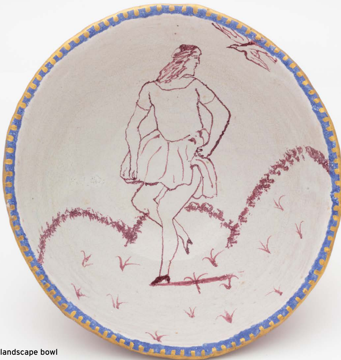
Lady in a landscape bowl Glazed ceramic 11 x 23cm Inscribed HN