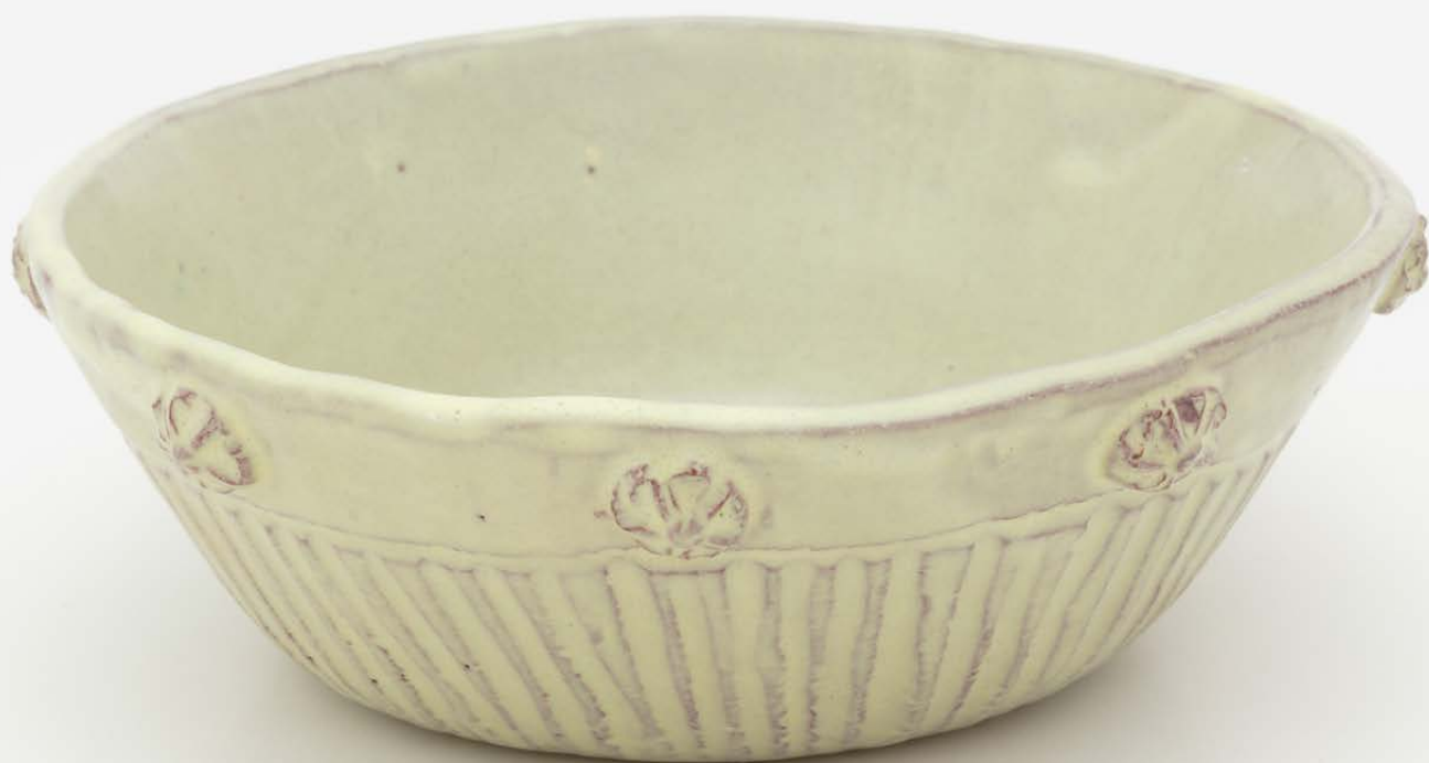
Flowers and lines bowl Glazed ceramic 6 x 16.5cm