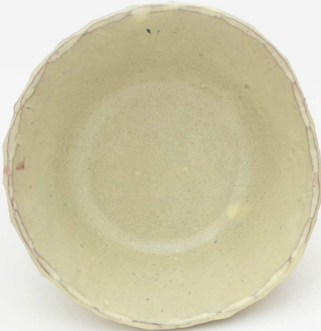
Yellowish bowl with carved edging Glazed ceramic 6.5 x 17cm