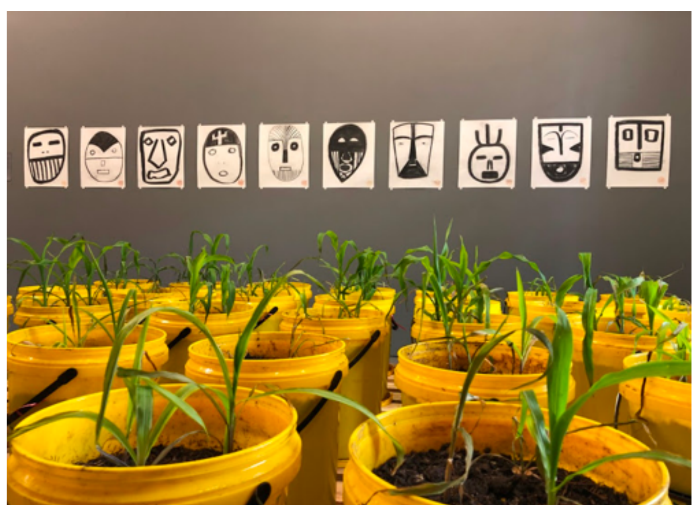
Paulo Nazareth, 'MAZE' (2021), installation view.

BL PREMIUM 06 AUGUST 2021 - 05:06 by CHRIS THURMAN