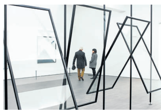
S.M.A.K. Municipal Museum of Contemporary Art.

Because I'm an artist, I'd recommend the museums. There are museums showcasing absolutely everything in the Netherlands. One is called the Bonnefantenmuseum [a historical and archaeological museum of the Dutch province of Limburg] in Maastricht. I'd recommend it for the wonderful experience of Dutch architecture. If you want to look at old masters, I'd suggest the Van Gogh Museum in Amsterdam. For cultural activities, go to the NDSM neighbourhood of Amsterdam. It's quiet now because of Covid, but there are institutions that offer interesting programmes film, theatre, music and delicious food. I'd also recommend hiring a bike to experience the city by cycling through the streets.